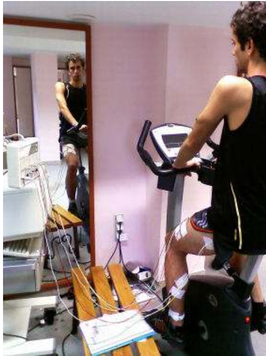
Figure 2. A research of lower extremity muscle groups [66] ( Photograph shot during a study by Sozen H. et al.).