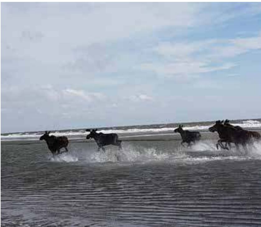
Figure 4.1. A small herd of moose running on the beach near Hooper Bay, Alaska. © Jan Olsen

In a Yup'ik world everything listens (Fienup-Riordan 2020). Seals listen, dogs listen, berries and birds listen, rocks listen; everything from a blade of grass to the wind listens. What though in a contemporary Yup'ik world is being heard? What is the land listening to when many of the people living upon it have been forced to direct their words, thoughts and actions into structures and systems of power outside the Yup'ik world? Do these structures of power listen? Then answer is often, no. Yet, there are positive developments being undertaken to empower and centre Indigenous knowledge and Indigenous people within conversations related to climate change and community health and resilience in the Circumpolar North (Bodenhorn and Ulturgasheva 2017; Marino 2015; Ray and Raymond-Yakoubian 2015; Young 2012). One strategy for opening up the 'ears' of Western world power structures to Indigenous frameworks, epistemologies and pedagogies is to demonstrate the ways in which Indigenous knowledge is foundational to many current and often deemed 'cutting-edge' scientific approaches (Jack et al. 2020).