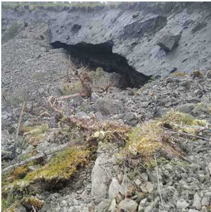
Figure 2.1. Effects of permafrost thaw in the area of Sebyan.

The startling dynamic of cryogenic changes and predictions articulated by the reindeer herders serve as an invitation to discuss the human capacity to adapt, predict, avert risk situations and negotiate safety in the face of profound unpredictability. They also invite us to consider available models for ascertaining the collective and individual ability to mitigate current and future environmental calamities. Recent revelations about the speed and intensity of the permafrost thaw and the amplified rate of ecological degradation have pointed to limitations and underestimation of the scientific models (see Shakhova et al. 2010; DeConto et al. 2012; Lovejoy 2013). Numerous reports have confirmed that the accelerated speed of degradation is currently on track to far exceed projections. This stresses the necessity to activate and shape those forms of collaboration that could open up new channels for addressing climate change and transgressing mainstream knowledge (Allen, Breshears and McDowell 2015;