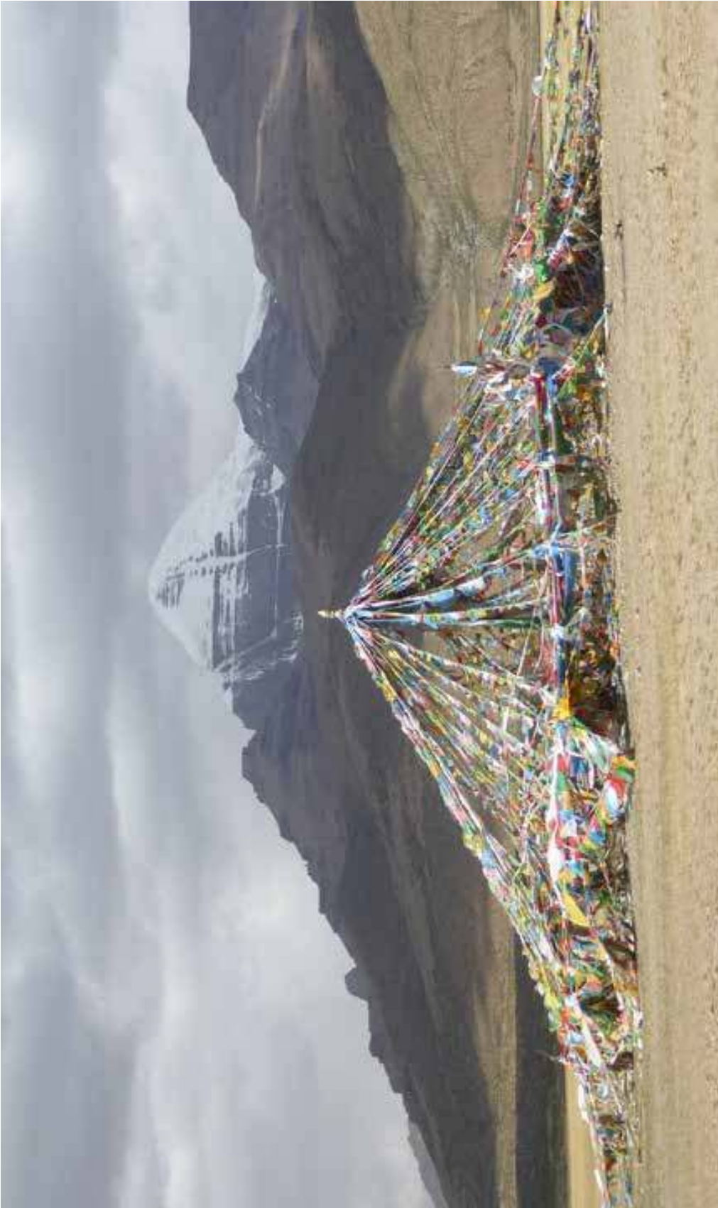
Figure 6.1. Mount Kailash with prayer flags.