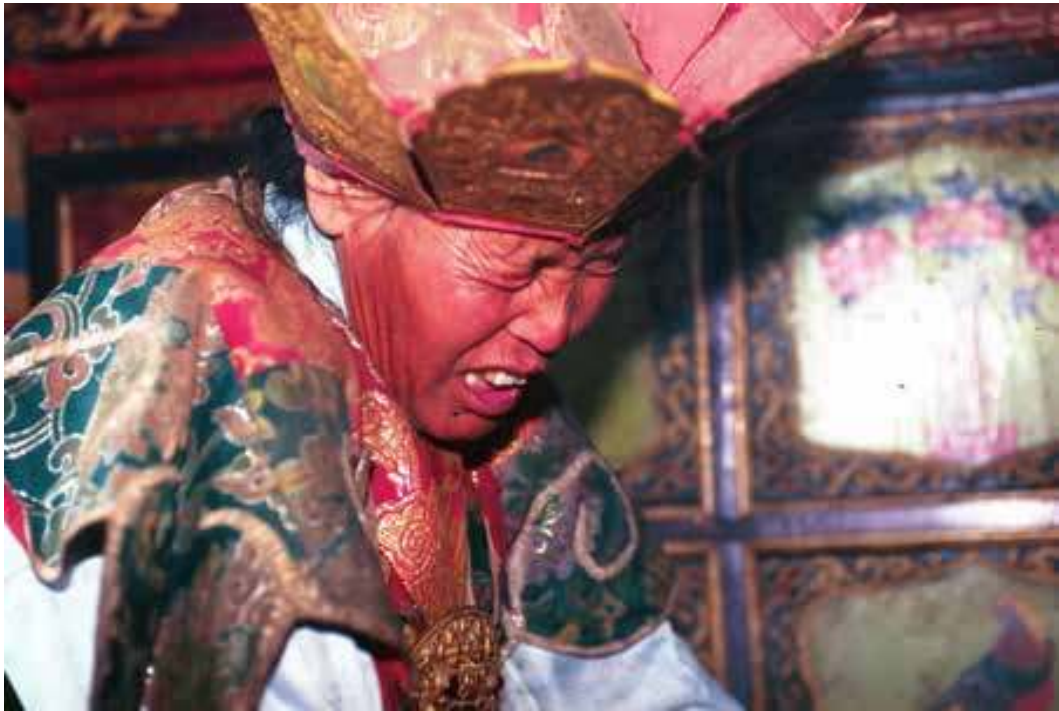
Figure 6.2. Oracle possessed by the Mountain Nyanchen Thanglha.

He is the lord of domestic and wild yaks, and the passage above seems to evoke animal sacrifice, a common ritual practice through which human communities on the Tibetan plateau related to their mountain spirits before their conversion to Buddhism. As a mighty mountain and a powerful mountain god, it has been reimagined and reframed many times according to different traditions, with scientific understandings being just one of the many layers of interpretation. The negotiation of different perspectives has a long history and is not binary, i.e. traditional vs. modern, local vs. global, sacred vs. secular.