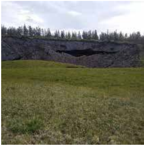
Figure 2.2. Deep hollow is about to trigger collapse of the mountain.