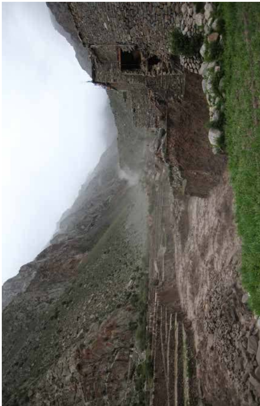
Figure 6.3. Glacial lake outburst flood in Limi.