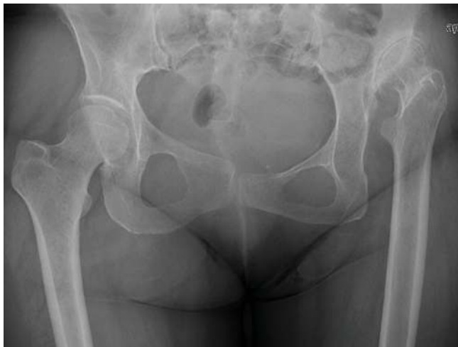
Figure 2. Radiograph of a Crowe grade IV deformity.

Hartofilakidis et al. [7] classified dysplastic hips in three overall categories based on radiographic appearance of the hip: in Type A the femoral head is articulating with the true acetabulum; in Type B the femoral head articulate with a false acetabulum and the false and true acetabulum are still connected; finally in a Type C the femoral head has migrated further proximal ( Table 2 ) and therefore true and actual acetabulum are separated. This classification