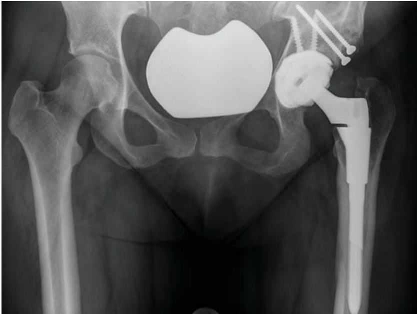
Figure 4. Postoperative radiographs after restoration of a Crowe grade III deformity. The anatomical hip center is restored with a femoral bone graft (Harris plastic).

according to the preoperative plan and is an appealing treatment option for patients undergoing THA for DDH.