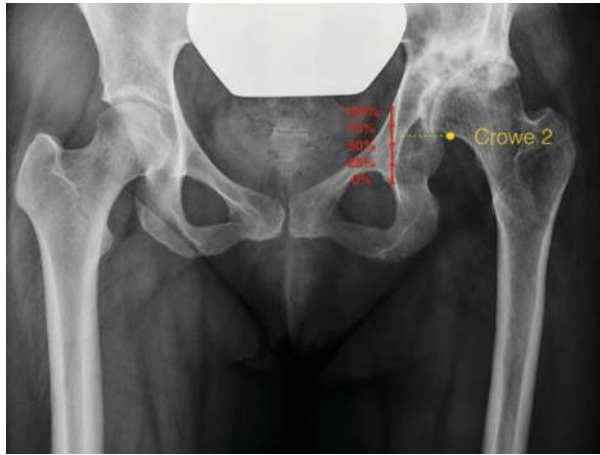
Figure 1. On the radiographs a Crowe grade II deformity is shown (50–74% subluxation). The subluxation is calculated by measuring the proximal migration between the teardrop line and the transition point of femoral head-neck.