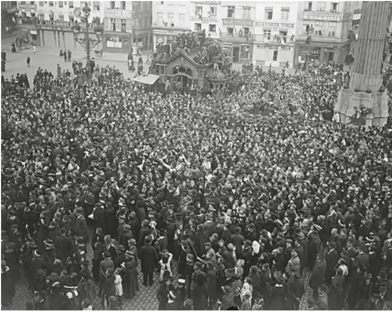
Figure 10 French civilians listening to a British regimental band playing in the Grande Place of Lille, 18 October 1918.

Thus, the liberation did not represent the end of the hardships related to the war. Other problems existed. Many evacuated locals sought to return home, a complex process lasting until 1920 for many. 28 Further, a vast programme of reconstruction was required for the entire battlefield area and former occupied zone, which had suffered heavily at both Allied and German hands (see Figures 11–12 ). 29 This was why Jeanne Lefebvre remarked on 24 October 1918, ‘We are liberated, but now that the first moments of joy have passed, we only see sadness and desolation everywhere.’ 30 The scale of destruction was massive: across the Nord eighteen communes were completely destroyed, sixty-five were more than 50 per cent destroyed, and 526 were damaged, with just fifty-nine intact. Further, 53,172 buildings and farms were completely destroyed, with 30,117 seriously damaged and 164,626 partially damaged. 31 Infrastructure – road, canals and especially railways – was devastated. 32 Both combat and occupation were responsible.