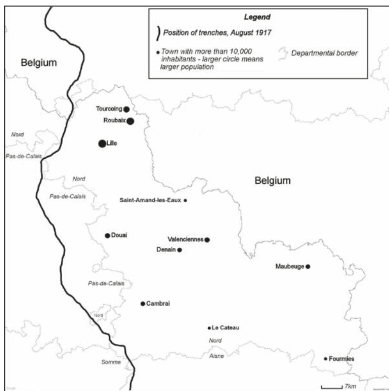
Figure 1 Map of the occupied Nord, August 1917.

By November 1914, the Germans partially occupied nine French departments and fully occupied one (see Figure 1 ), representing about