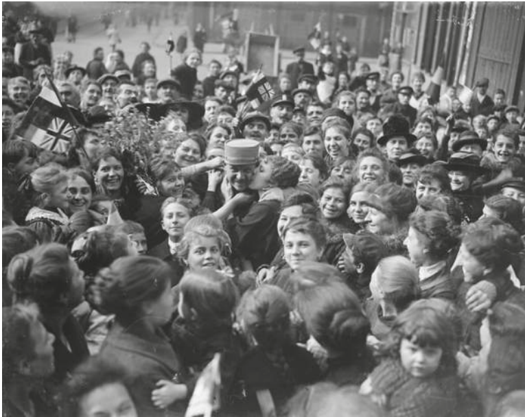
Figure 8 Girls kissing the first French soldier to enter Lille, 18 October 1918. © Imperial War Museum, Q 9582.

Official celebrations began straight away, including military parades by the liberating armies, exchanging honours and celebratory discourses, and visits to key towns by the President and Prime Minister, such as those mentioned in the opening lines of this book. Marshalls Pétain and Foch, and King George V also visited the liberated regions. 24 However,