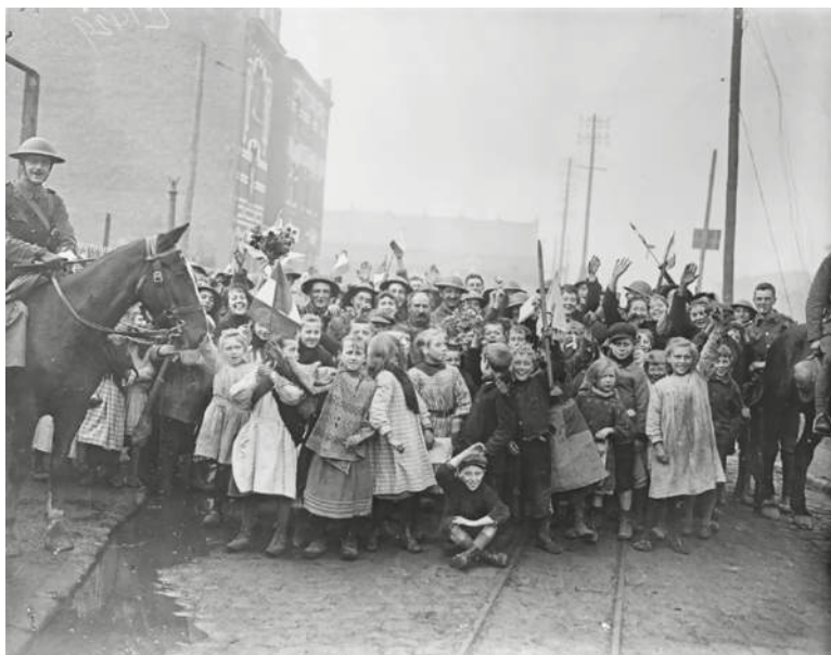
Figure 9 Frenchwomen and children cheering the arrival of the men of the British 57th Division at Lille, 18 October 1918. © Imperial War Museum, Q 9589.

this was not the end of military occupation: Allied armies remained in the liberated Nord for months, initially carrying out humanitarian work. A French military report underlined that for the period up to 25 November 1918 the British army provided considerable transport, food and health care to the destitute, hungry population, including transporting tens of thousands of refugees and saving the 790,000 inhabitants (450,000 of whom were in Lille-Roubaix-Tourcoing) from famine. The report's author described this as 'a marvellous act of systematic and ingenious charity' and concluded, 'For this beautiful work, [British] army heads and soldiers have the right to the most profound gratitude of France.' 25 However, eventually the British presence and regulations led to discontentment among locals, who complained of a second occupation. 26 Further, lack of provisions continued to plague the area despite the fact that on 31 December 1918 the CANF was abolished and the Ministry of Liberated Regions henceforth oversaw food provisioning and attendant controls. 27