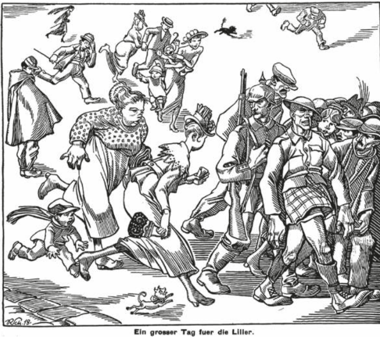
Figure 7 Front cover of Liller Kriegszeitung , no. 118 (18 July 1918) showing Lillois running to greet British, especially Scottish, prisoners of war. The caption reads ‘A great day for Lillois ’.

Universitätsbibliothek Heidelberg, Liller Kriegszeitung , no. 118 (18 July 1918), p. 1; accessible online at http://digi.ub.uni-heidelberg.de/diglit/feldztglilkr1917bis1918/0713?s_id=a8dc59fd084727fd59a0ee45840b4647 ).