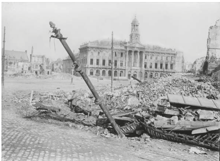
Figure 11 View of the main square in Cambrai, showing damaged buildings and the town hall, 23 October 1918.