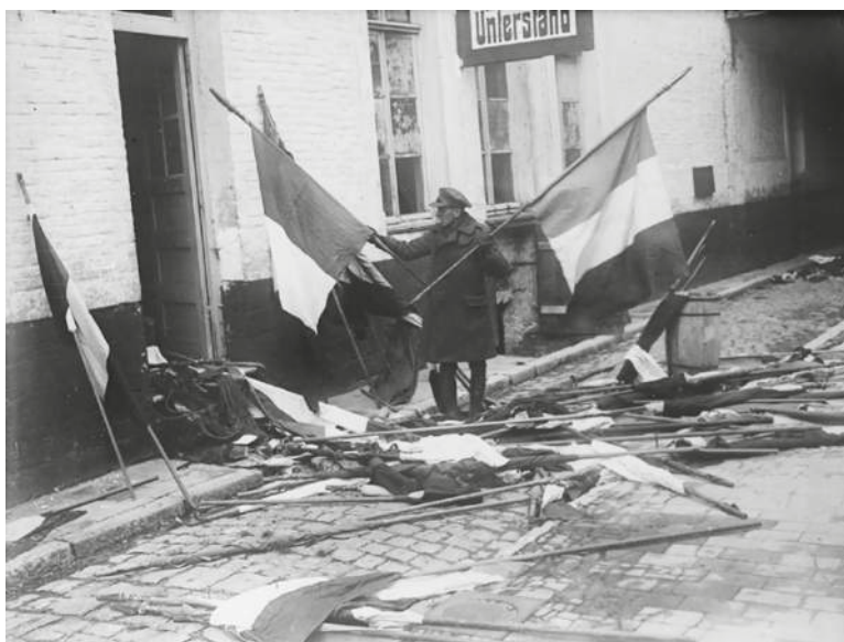
Figure 6 British soldier checking a store of French flags confiscated from the inhabitants of Douai by the Germans, 25 October 1918.