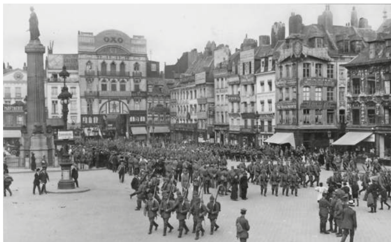
Figure 5 Columns of German infantry moving through the main square of Lille.