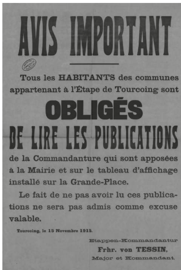
Figure 2 German poster, Tourcoing, 15 November 1915: 'IMPORTANT NOTICE: All the INHABITANTS of the Étape of Tourcoing are OBLIGED TO READ THE PUBLICATIONS of the Kommandantur displayed at the Mairie and on the noticeboard installed in the main square. The fact of not having read these notices will not be permitted as a valid excuse.' This regulation hints that some locals, truthfully or otherwise, claimed ignorance of German regulations. Presumably those who did not read German posters, not having read this poster, remained ignorant of the new rule until punished. Archives Départementales du Nord, Lille, France, 9R745.