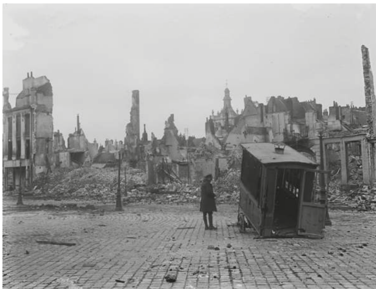
Figure 12 British soldier checking a wreck of a tram in the ruined Grande Place at Douai, 25 October 1918.