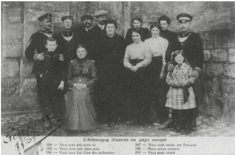
Figure 3 Postcard of the Mayor of Crèvecœur-sur-l'Escaut and his family with German gendarmes (front), sent to Préfet du Nord, 31 July 1919.