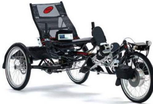
Figure 5. The “RehaBike” by Hasomed (outdoor bike)

In general, FES cycling ergometers can be divided into two major types, mobile and stationary types. The mobile type, a locomotion device, focuses on muscle training as well as giving some mobility to subjects whose muscles can still be excited. Several research groups have developed a mobile cycling system using standard or recumbent tricycles for SCI subjects. Usually, the mobile type of cycling ergometer is an open-loop system, which is not only a rehabilitation modality but also a recreational activity.