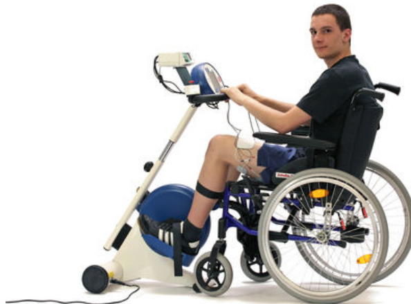
Figure 6. “RehaMove” FES System coupled with Motomed stationary bike

The stationary type of cycling ergometer is usually used for aerobic exercise training in subjects with an SCI to condition their muscle strength and enhance cardiopulmonary function.