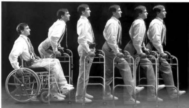
Figure 1. Advertisement of the Parastep System