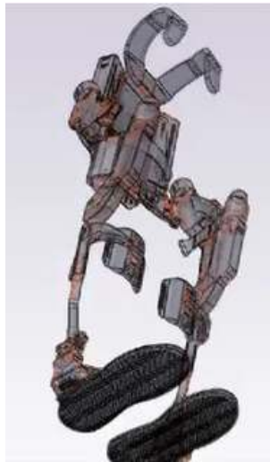
Figure 3. "eLEGS" exoskeleton by Berkeley Bionics

In 2010 Berkeley Bionics unveiled eLEGS, which stands for "Exoskeleton Lower Extremity Gait System". eLEGS is another hydraulically powered exoskeleton system, and allows paraplegics to stand and walk with crutches or a walker. In 2011 eLEGS was renamed Ekso. Ekso weighs 20 kg, it has a maximum speed of 3.2 km/h and a battery life of 6 hour [47].