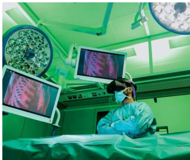
Figure 2. An example of virtual reality application during minimally invasive lung cancer surgery in the operating theater.

However, only very few reports are available on the use of AR, VR, or MR for surgical planning or intraoperative navigation for lung surgery [53–55]. Frajhof