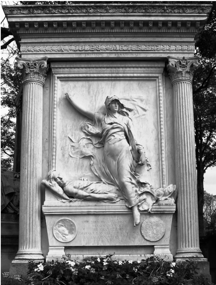
Fig. 1. Tomb of Jules Michelet by Antonin Mercié, Père Lachaise cemetery, Paris. Photo by Pierre-Yves Beaudouin, http://commons.wikimedia.org/wiki/File:Père-Lachaise_-_Jules_Michelet_01.jpg .