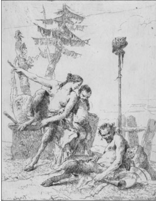
Gianbattista Tiepolo, 'Satyr family (Pan and his family)', etching from Scherzi di Fantasia series (c.1743–57). The Metropolitan Museum of Art, New York, ©MET under OASC licence, http://www.metmuseum.org/art/collection/search/361896

This takes us back to the satyr-satire connection. This false etymology disseminates the idea that satire derives from or is connected to the original language of 'monstra' [monsters], creatures whose nature is hybrid, unclear. The satirist is animated by an animal rage, that can kick off, twitch in any moment; he is an unbridled, brutal and riotous being. In the depth of his language brews a primordial violence. 11