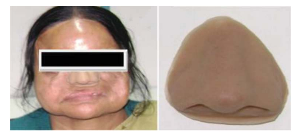
Figure 11. Patient with cosmetic silicone nose.

over functional prosthesis in that case the passive prosthesis plays the role of cosmetic prosthesis with the removal of additional component of functional prosthesis ultimately reduced the weight. The patients were assessed by the clinical team members and decided to fit the passive prosthesis, which was the suitable option for the patients. The criteria for selection of the patients were (1) uncosmetic appearance of the stump, (2) the functional prosthesis cannot be fitted, (3) the patient needs only cosmetic appearance, (4) unavailability of the functional components and (5) pain and insensitive stump. The selected patients were again assessed for the appropriate passive prosthesis such as finger prosthesis, partial hand prosthesis, toe prosthesis, below elbow prosthesis or maxillofacial prosthesis. The custom made passive prostheses were fabricated by using silicone material, which is the most preferable material nowadays having biocompatibility properties and most natural appearance [7–9]. The passive custom made