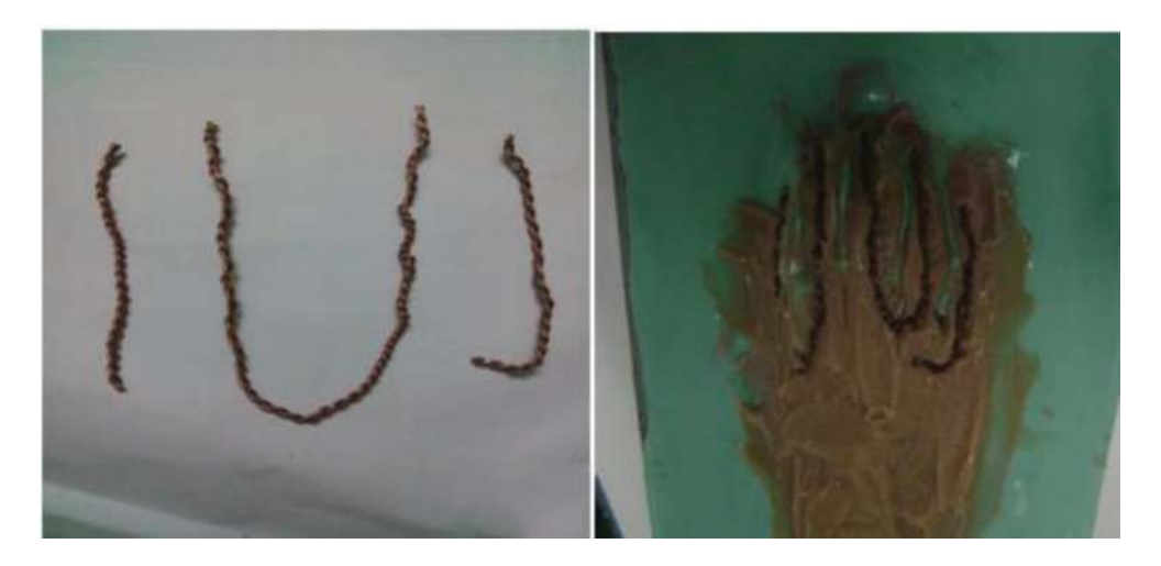
Figure 6. Copper wire and silicone die of partial hand with copper wire.