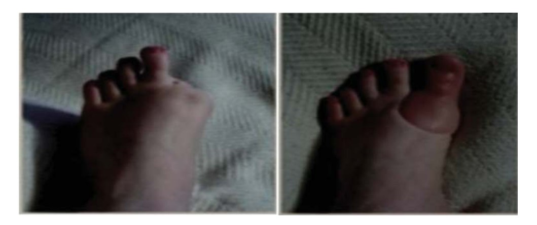
Figure 3. Before and after fitment of silicone toe.

The cosmetic prosthesis of the finger and hand is not usually having the movable digits. The prosthesis is only used for the cosmesis purpose and psychological benefit for the patients. Now these prostheses are having some passive movements of the fingers due to the involvement of some copper wires inside the prosthesis during the time of fabrication. This process is cost-effective and time-saving [6] ( Figure 6 ).