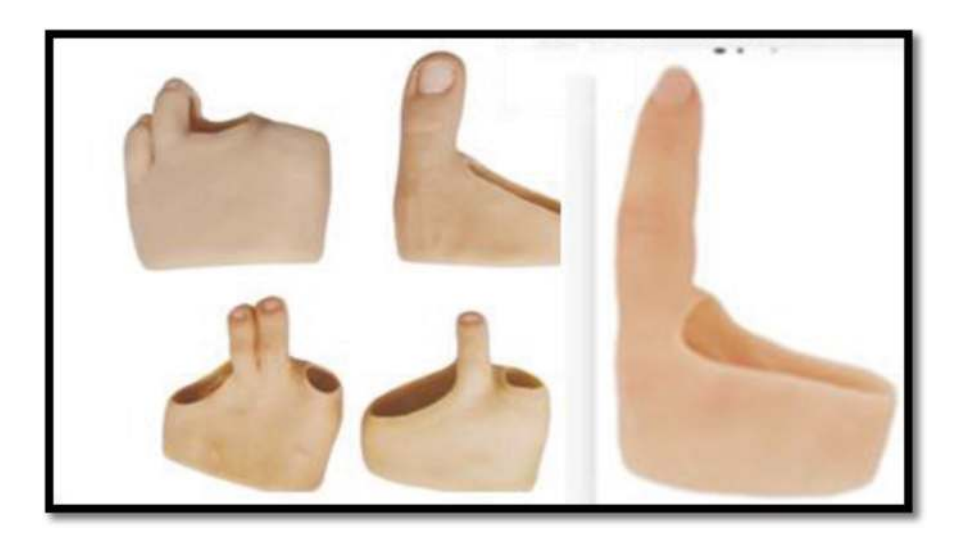
Figure 7. The finger and toes with strap suspension.

The face is considered as the most beautiful and expressive part of the body. The eye, ear, chick and nose, play different roles in various expressions ( Figures 8–11 ). If the patient lost any part of the organ in the face, they felt as a half-dead person. These kinds of people were not having the courage to face the society. In the process of plastic surgery, they may modify the structure but