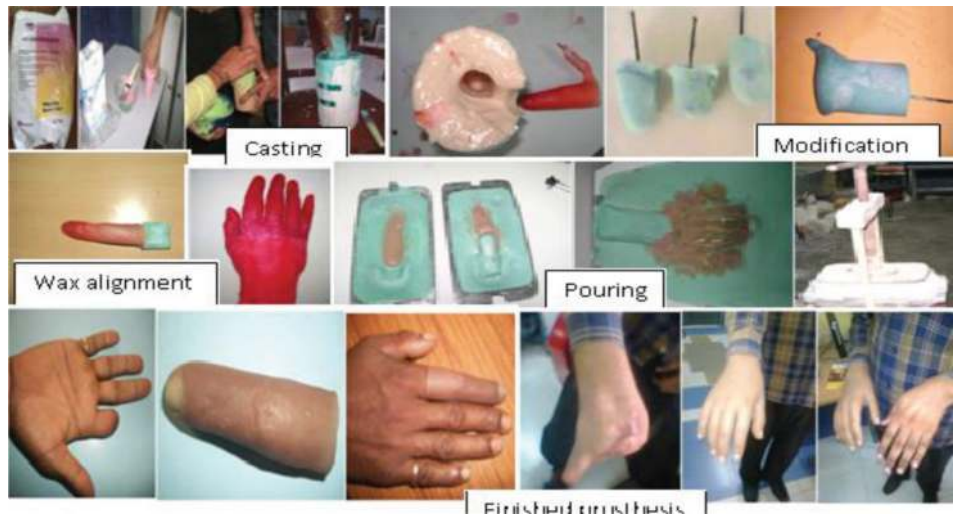
Figure 12. Procedure for fabrication of finger and hand prosthesis.

The male of 35 years old reported to the clinic having one middle finger amputation of the LT hand. He is professionally an engineer, and the chief complaint was that he had lost his support during the activities like feeding. The stump was good to fit the cosmetic silicone prosthesis with passive function. The copper wire was inserted inside the silicone mixture during the pouring process for the passive movement of the prosthesis. After the fitment of the prosthesis, he can be able to hold the bottle, got support to write and found improvement in activities of daily living ( Figure 13 ).