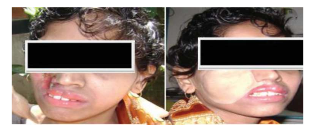
Figure 10. Before and after the use of silicone chick prosthesis.