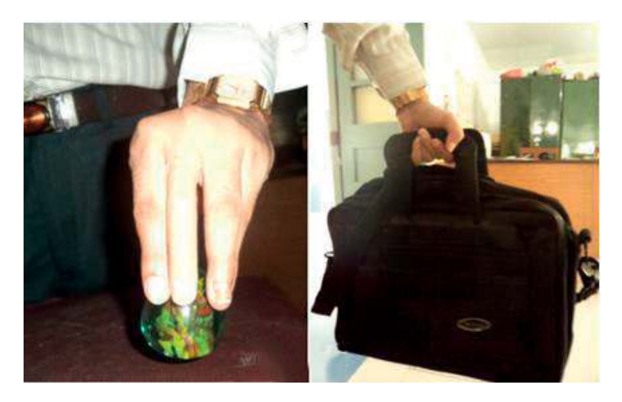
Figure 13. Patient with middle finger silicone prosthesis doing ADL.