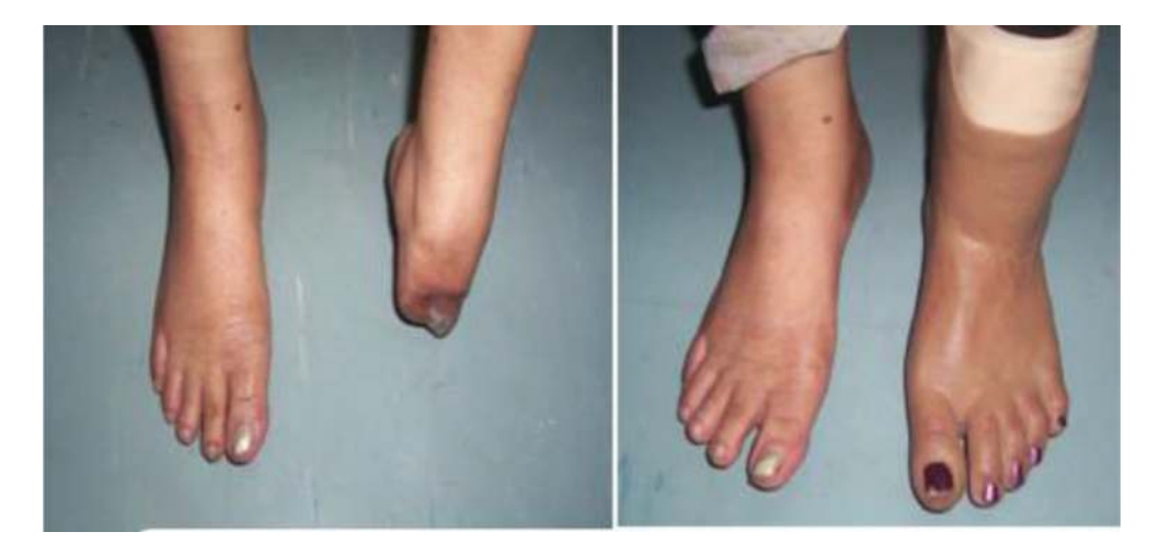
Figure 5. Silicone partial foot prosthesis.

The attachment of prosthesis depends upon the remaining part and contours of the stump. The finger amputation of PIP and DIP level, the suction suspension is the method of attachment, and amputation through metacarpophalangeal attachment is through strap suspension ( Figure 7 ). The alignment is done before the fabrication during this process, and the overall length is checked with the opposite limb.