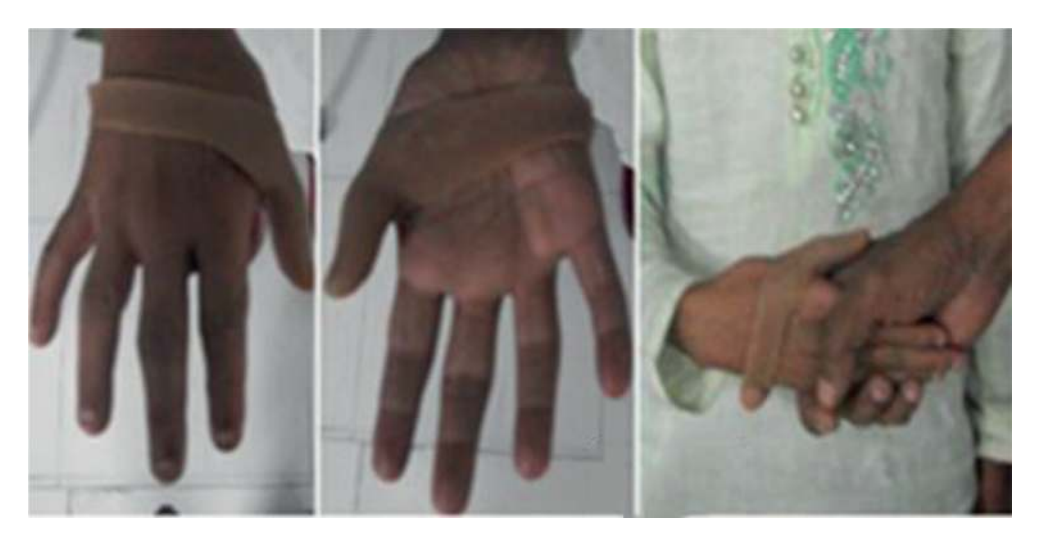
Figure 14. Cosmetic finger with strap suspension.