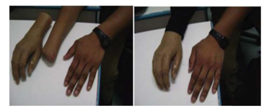
Figure 2. Partial silicone hand prosthesis.

Apart from the finger and hand, toe and partial foot silicone prosthesis is mostly accepted by the patients [5] ( Figures 3 , 5 ). The cosmetic prosthesis mimics the natural appearance without any complicated mechanism. These are easy to use with very low maintenance. So, nowadays, the use of cosmetic prosthesis is more than a complicated functional prosthesis.