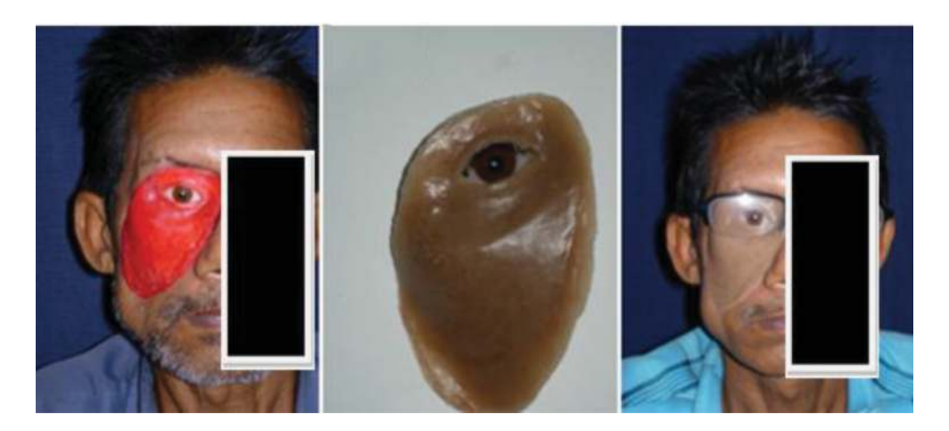
Figure 8. Patient with cosmetic eye.