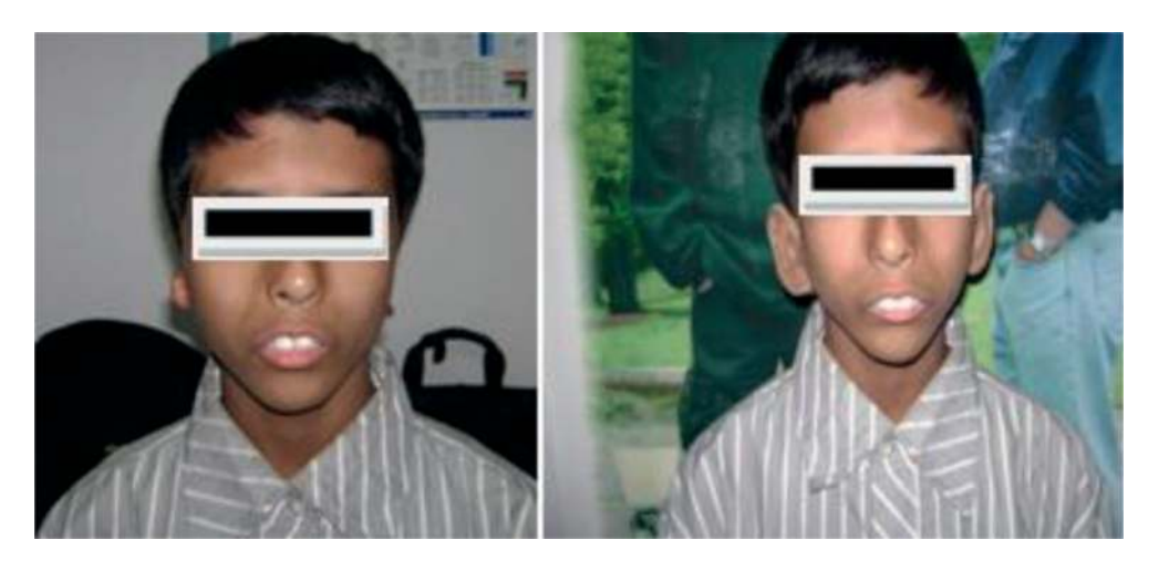
Figure 9. Before and after photo of cosmetic ear.

the scar and lost part not be fulfilled. The role of rehabilitation can be able to reduce the disfigurement by the cosmetic prosthesis. The silicone is very compatible with the body and it can be used as laryngeal prosthesis in the case of patient with tracheotomy during the chemotherapy. The number of breast cancer is increasing nowadays; the silicone breast is considered as the best option to maintain the shape without any complications.