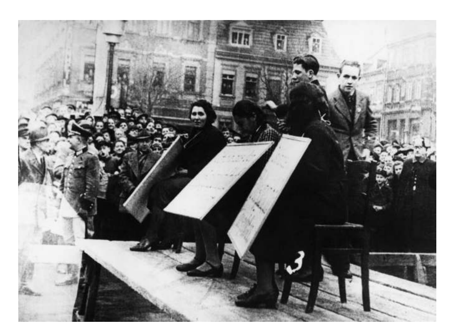
Figure 2 Public shaming of Jewish women in Linz, Austria, during the Kristallnacht , November 1938.

Roman spirit. For Nazis like Ernst Schönbauer, the oriental roots would have meant that the law would be racially impure (Riccobono 1925-6; Schönbauer 1939: 390-1).