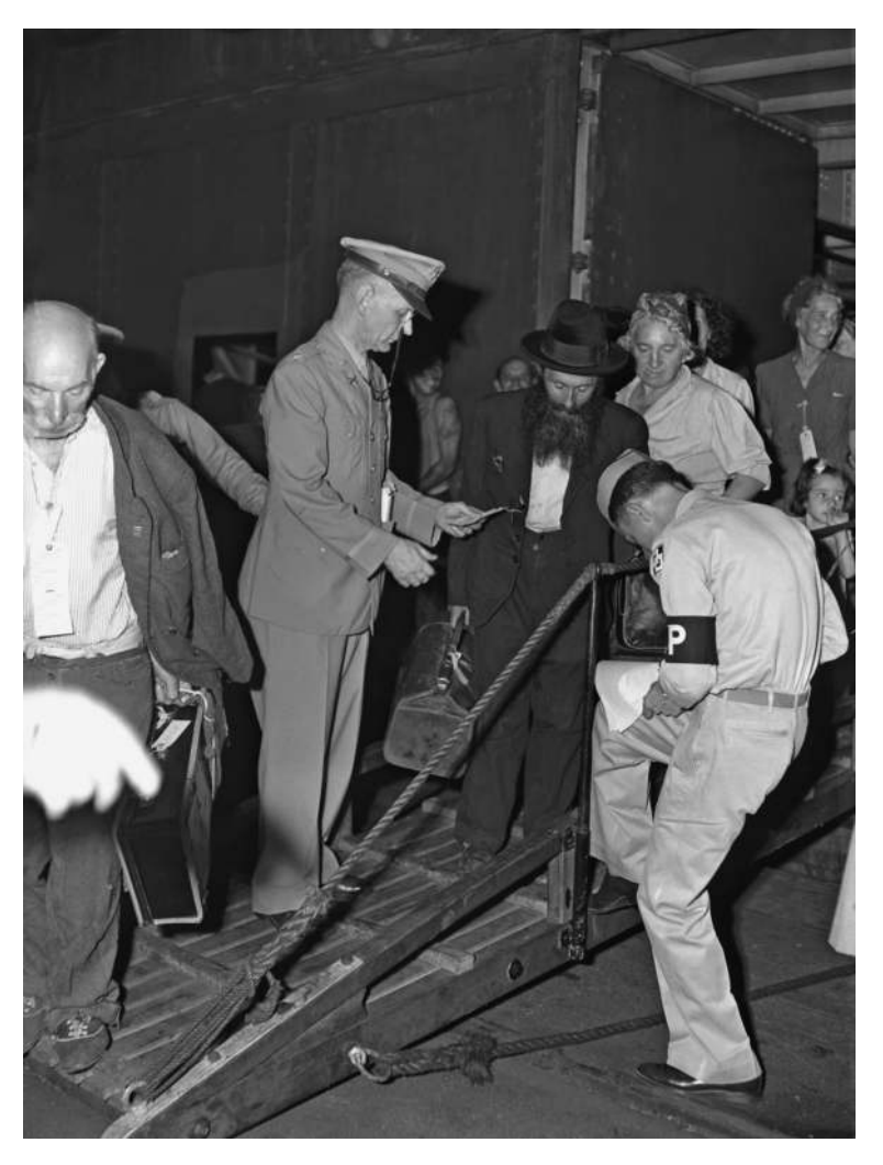
Figure 1 An immigration officer checks the names of refugees escaping Nazi persecution.

The emigration path of those who escaped led first to neighbouring countries – France, the Netherlands or Czechoslovakia. For instance, before reaching the United States, Hannah Arendt, after being arrested by Gestapo for helping her Marxist friends and colleagues, escaped to France, where she ended up being detained in the women's concentration camp in Gurs (Coser 1984: 191). For those wanting to escape Continental Europe, the route through Spain and Portugal was for a long time the only way to do so. In particular, those caught in southern France were forced to cross the Pyrenees to reach Lisbon. The United States admitted 1,300,000 persons, while 759,000 ended up in Latin America. The UK sheltered 80,000 refugees, while 55,000–60,000 emigrated to Palestine. Additionally, some 100 scholars found positions in Turkey, where Kemal