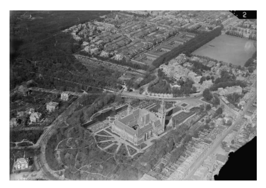
Figure 4 Aerial photograph of the Peace Palace in The Hague (opened in 1913, photo from 1920-40).

the Russian Empire. His international career was no less outstanding. In 1913, he was among the dignitaries who inaugurated the Hague Peace Palace, a crowning achievement of the field of legal scholarship he and his teachers had represented, and served as a judge in major disputes before the First World War broke out.<sup>3</sup>