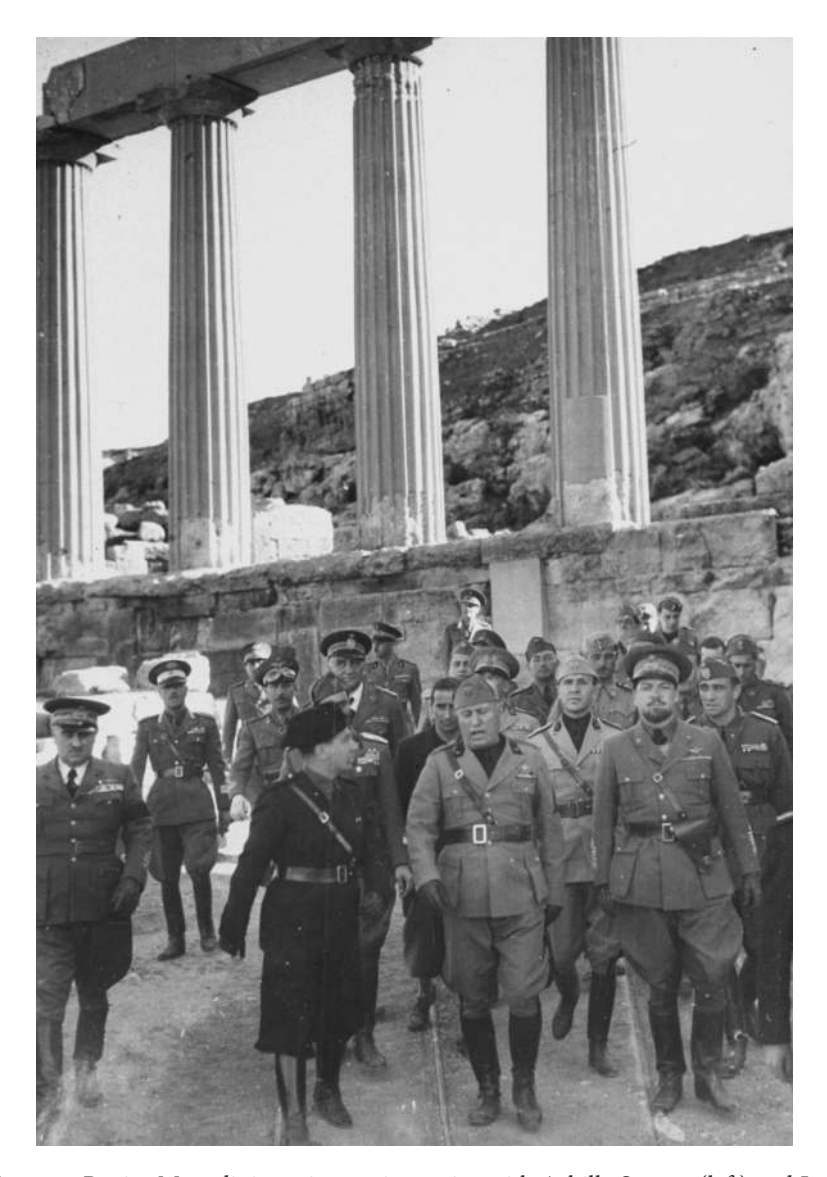
Figure 5 Benito Mussolini touring ancient ruins with Achille Starace (left) and Italo Balbo (right).

opponents aligned themselves with the expansionist policy that realized the old dream of an African Empire, reacting to the sanctions imposed by the League of Nations.<sup>17</sup> On 9 May 1936, the Duce triumphantly proclaimed from the balcony of Palazzo Venezia 'the reappearance of the empire over the fatal hills of Rome' (Giardina and Vouchez 2000: 250ff).<sup>18</sup> The highest point of political support for Mussolini corresponded to the climax of the rhetoric of the myth of Rome. While Vittorio Emanuele, the King of Italy,