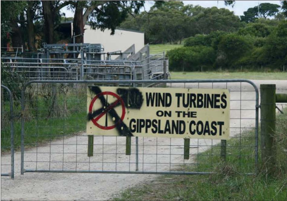
Figure 6.3: Principles of amenity and landscape value still mix with more utilitarian and instrumental uses of land

rural amenity and lifestyle, while supporting living opportunities in rural areas throughout the Shire. 74