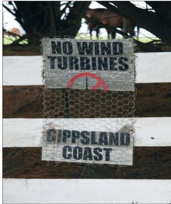
Figure 6.1: Farm gate protest, Gippsland Coast

orange-bellied parrot, are one such matter relevant to granting approvals for wind farms under the EPBC Act. 39 The company behind the Bald Hills proposal, Wind Power, said the federal decision was 'completely unreasonable'. 40 On the other hand, a spokesman for the Tarwin Valley Coastal Guardians lauded the federal decision, noting, 'There were over 1500 objections to the proposal'. Another local greeted the decision as a win for locals, commenting, 'If people want to put wind farms in