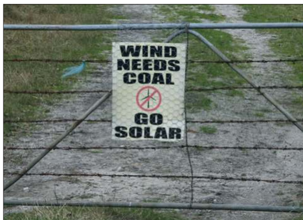
Figure 6.2: Competing values, farm gate protest

under recent planning law amendments again brings the map into play as the prerequisite for legal decision-making. The Bald Hills project escaped the spatial net of restrictions that now surround wind farm developments in Victoria. Yet as the wind power company website reflects, there remains an acute