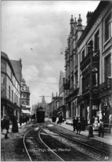
High Street in Merthyr Tydfil, WHS Kingsway, 1910

The buildings downtown, like the miners' houses, had fresh coats of paint. Flowers hung from lampposts, and the sun moved in and out from white clouds—a very different image than a photograph from 1910 I had found on a Welsh genealogical site on the Internet. In this photograph, the atmospheric effect on the buildings in the distance is significant. A stormy day could have caused this, but the people are hardly blurred, indicating a quick snap of the shutter. It must have been bright, with the clouding of the buildings resulting from the particulate matter pumped into the air by the smokestacks. Puddles gather on the street, and the tracks of a streetcar narrow into the distance. The photograph is of High Street, and men and women dressed in black line the walks next to the storefronts. In Evan and Margaret's time, these streets would have been even more densely populated. Between the hours of six and ten p.m., the working class would emerge in hordes for their evening promenade: girls in canvas dresses covering woolen petticoats, colliers with tin boxes and broad-brimmed hats. Women in checked shawls would sell their eggs, butter, and bacon. Apples and herring were sold in barrels. Amid the food retailers, quacks would call out their newest remedies for ailments ranging from indigestion to immoderate passions. Ballad singers would dispense a tune at the price of one pence per song.