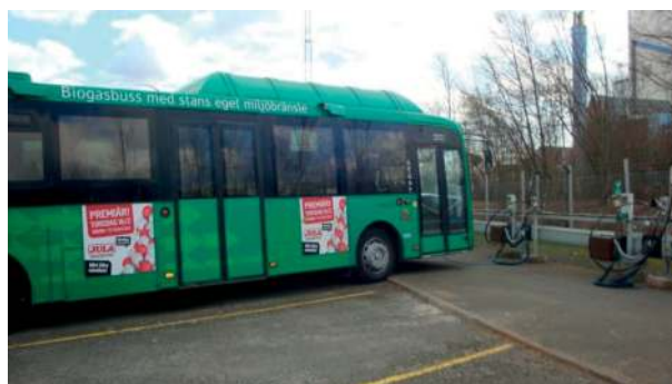
Figure 2. Biomethane filling station for buses in Kristianstad.

In Kristianstad (capital of Skåne), digestion of organic matter into biogas has become the most important way to reduce the negative environmental impacts of waste and instead use it as an energy resource. The biogas plant, as well as the units for upgrading gas, is owned by the municipal company, Kristianstad Biogas, which is a part of the municipal energy company. In Figure 2 biomethane filling station for buses located nearby Kristianstad biogas plant is presented. The municipality is aiming to have a fossil fuel free fleet by 2020, mainly running on biogas [21].