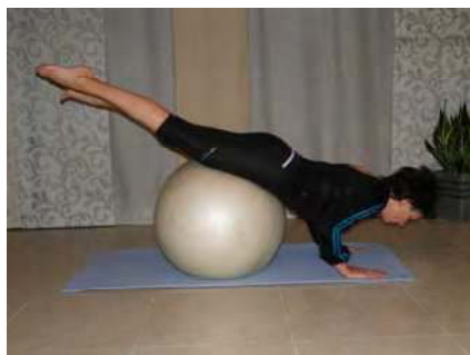
Fig. 10. Push-up exercise on Swiss ball, movement with activation of strong core

It was found that the upper trapezius and serratus anterior are under differing cortical control mechanisms, with trapezius but not serratus demonstrating both contralateral and ipsilateral responses to cortical magnetic stimulation. Increased upper trapezius tone and constant readiness to activate disturbs the humero-scapular rhythm and is also an indication of fatigue or compensation of serratus anterior. As muscle fatigue can be a central phenomenon as well as a peripheral phenomenon, the upper trapezius may have been recruited differently during or after the task. (Alexander et al., 2007, Hunter et al., 2006 as cited in Szucs et al., 2009) It is ball, important that performing Pilates Push-up, which is an exercise in close kinematic chain, serratus anterior muscle should be activated rather than a dominant role of upper trapezius muscle which can be achieved by the alignment of spine, unlocked elbow joints, lower - costal breathing and touching stimulus of an instructor during execution of an exercise.