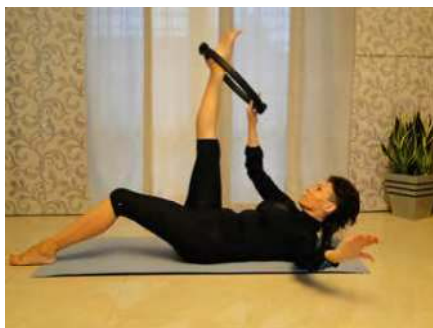
Fig. 1. Multidimensional exercise with Pilates circle

Exercises on professional Pilates' devices are mainly resistance exercise performed with the aid of springs and pulleys, but also stress relief of certain parts of the body can be achieved. The machines can be customized to the needs of the practitioner. The resistance during the exercise allows movement to be isolated and performed in the proper plane. Additional resistance prevents automatic movements being responsible for injuries. The exercises using professional Pilates' devices can be performed in post-acute state of sports injuries.