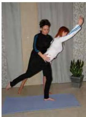
Fig. 6. Manual stimulus for increasing body awareness and desired muscle recruitment

helps to focus concentration. Awareness of the body also assists in reducing overwork, strain and tension. Sportsmen particularly need awareness of their body, particularly the muscular sensations, so as to direct mental and physical efforts efficiently. Attending to the feedback from the proprioceptor system makes the individual aware of what is being done. Precision assists coordination; this is the practical application of focused awareness.