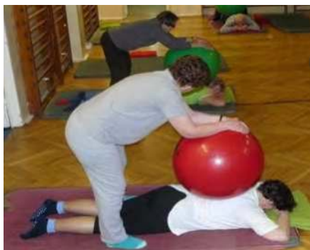
Fig. 2. Sensoric massage with Swiss ball

In physiotherapy praxis Pilates based exercises are also performed with a gymnastic stick, a gym ladder and a stool. Pilates based exercises using a Swiss ball are also very popular, as is sensoric massage with this tool.