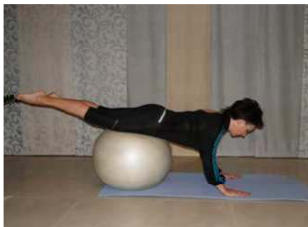
Fig. 9. Push-up exercise on Swiss ball, starting position without “locked elbows”