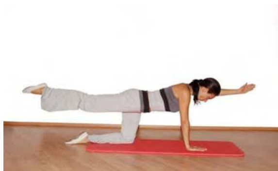
Fig. 4. Stability and endurance training: core muscle activation with limbs exercises