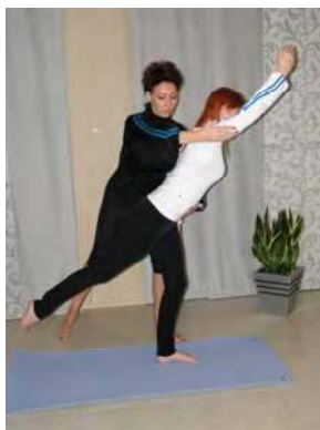
Fig. 7. Execution of strong core with body alignment before and during movement

Pilates method of body conditioning may be generalized to have three major effects upon the powerhouse. First, Pilates affects the posture of the pelvis, which results in postural changes to the lumbar spine. Second, it works directly upon the musculoskeletal structure of the spine (the lumbar spine in particular) by strengthening, stretching, and lengthening the spine. Third, Pilates affects the structural integrity or tone of the abdomino-pelvic cavity as a whole. The posture of the pelvis largely determines the posture of the spine. The spine sits upon the base of the sacrum; therefore, any change in the sagittal posture of the pelvis will change the level of the base of the sacrum. The level of the base of the sacrum will in turn affect the curve of the lumbar spine. However, once the base of the sacrum is uneven to any degree, the spine must have a curve in it to compensate. This curve is necessary to eventually create a level base for the head to sit upon. This righting mechanism to create a level base for the head is necessary to place the eyes and the labyrinthine receptors of the inner ear on a level plane, this being necessary for proper static and dynamic proprioception of our body.