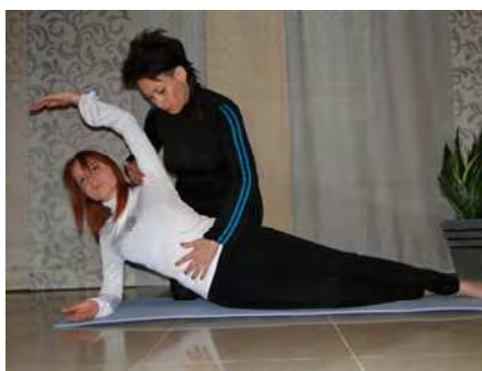
Fig. 5. "Hands on" for body alignment execution

Focusing on the therapeutic movement, particularly in the case of sport injuries helps to avoid errors in repeating the exercises without therapeutic supervision. Proper learning of movement can be also achieved with the help of hands-on guiding, assisting correct movement (touch can improve muscle engagement and relaxation). Verbal cues also play a very important role in increasing awareness of the therapeutic movement being performed and learnt. This applies particularly in the case of a limited amount of information such as typically used with elderly or stroke patients (Lange et al., 2000; Latey, 2000). Verbal cues of the Pilates based exercise instructor as well as his tactile stimulation (hands-on) aim to motivate the exercisers to increase the focus on how to perform movement and maintain the desired body position, so that sensorimotor integration is stimulated. Moreover, connecting the mind and body requires the exercising person to tune into their bodily sensory systems.