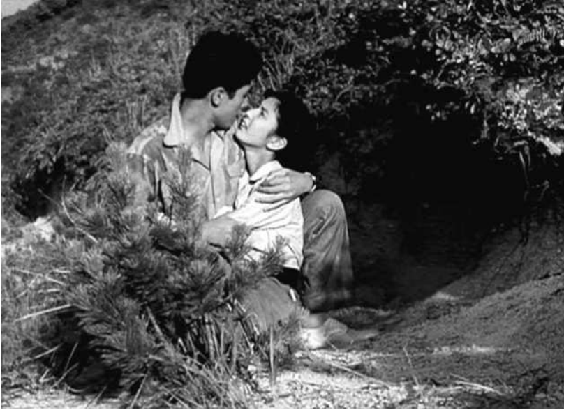
FIGURE 1.2. Ogata and Emiko embrace in Gojira (1954).

the group rush back down the hill. As they run for their lives, Emiko, Dr. Yamane's daughter, trips and falls. Almost immediately in the classic hero-saves-dame image, Ogata, her love interest, comes to her rescue, holding her up in a lovers' embrace as they both look worriedly in the direction of the monster.