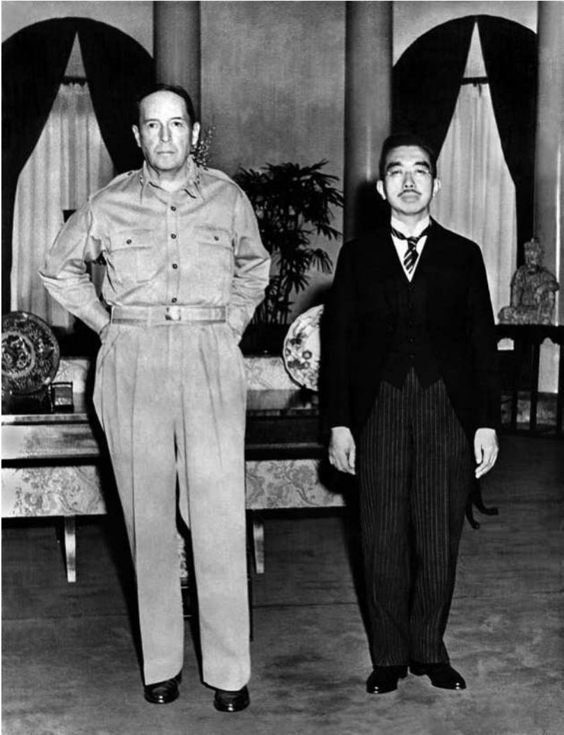
FIGURE 1.4. Hirohito and General MacArthur meeting for the first time on September 27, 1945.