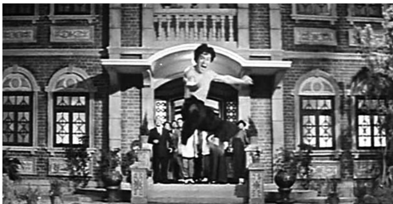
FIGURE 1.1. Bruce Lee leaps in Fist of Fury (1974).