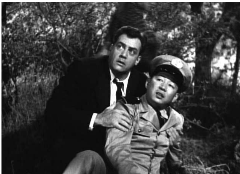
FIGURE 1.3. Burr helps an Asian man in Godzilla (1956).

guidance and protection of American militarism that, along with the cooperation of similarly American-led authoritarian regimes in South Korea and Taiwan, virtually relieved Hirohito's and Japan's wartime and colonial responsibilities as well as America's own atrocities and war crimes, hence nullifying decolonization. The American empire simply replaced the Japanese empire. The critical valences in Gojira were short-lived. After the surprising success of the film, and in conjunction with the rising consumerism and depoliticized culture, Gojira became a franchise. The first Gojira , much like its American counterpart, succumbs to the logic of capitalism and American militarism, vanquished in the deep sea and never to be awakened again.