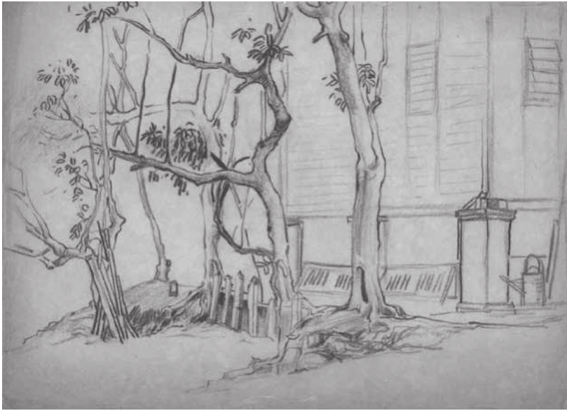
Figure 8.3 Detailed sketch of the orchard by Lim Mu Hue (courtesy of the estate of Lim Mu Hue)

one sweeping, panoramic construction. The final 1964 work in Chinese ink on sepia rice paper [ xuan paper, 宣紙] measured six by four feet. The viewpoint is located as if in mid-air at a high vantage point above the orchard, looking down at its entirety on the ground. However, the neighbouring areas of the orchard are not inscribed, accentuating focus on that space. Hsü subsequently noted that Lim had taken the liberty to remove some trees to emphasise the visibility of several key areas of the painting, but the depiction is otherwise accurate (Hsü 1967: 4).