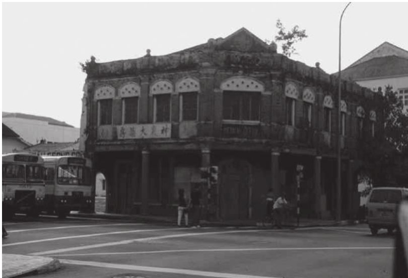
Figure 8.1 Shen Nong Medical Hall at Bras Basah Road, now demolished