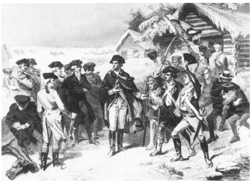
Washington and a Committee of Congress at Valley Forge (National Figure 2.1 Archives)

of Canada, expressing the hope "of your uniting with us in the defense of our common liberty."21