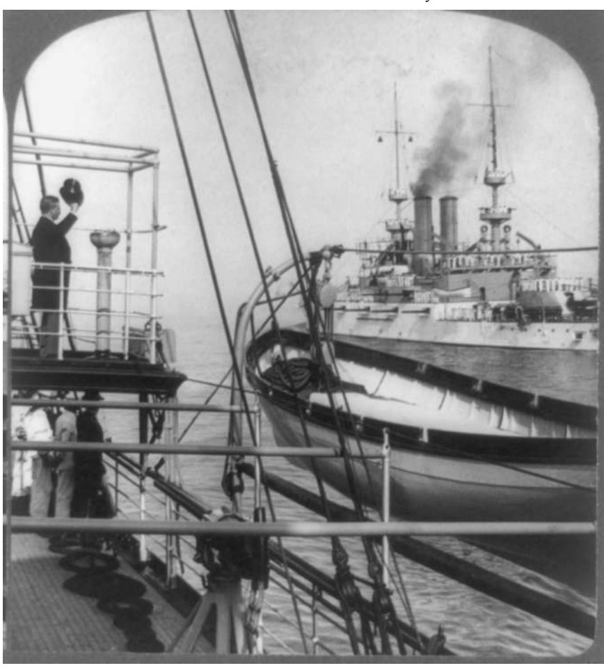
Figure 8.1 Theodore Roosevelt reviewing naval parade off Long Island, 1903

and later admitted privately that "no vestige of their organization should be allowed to remain. They cannot get along with the navy, and as a separate command with the army the conditions would be intolerable."39 In his final year in office, Roosevelt ordered marines off ships, purportedly to free up men to form units to seize advance bases, but Congress, persuaded intellectually and politically, passed a rider countermanding the president's order.<sup>40</sup>