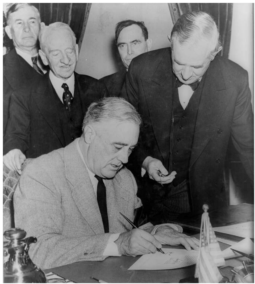
Figure 6.1 Franklin Roosevelt signing the declaration of war against Japan in the presence of congressional leaders, 1941

Meanwhile, the crisis with Japan was worsening. In response to an unacceptable Japanese note on November 20, Marshall and Stark urged diplomatic maneuvering to allow more time to deploy forces to the Pacific. Roosevelt overruled them, as he had the previous summer when he imposed the oil embargo, and instead sent an ultimatum on November 26 that the Japanese were sure to reject. As Stimson recorded in his diary, "The question was how we should maneuver them into the position of firing the first shot without allowing too much danger to ourselves." With diplomacy failing and with the Japanese task force secretly headed toward Hawaii, the die was cast for war with Japan.