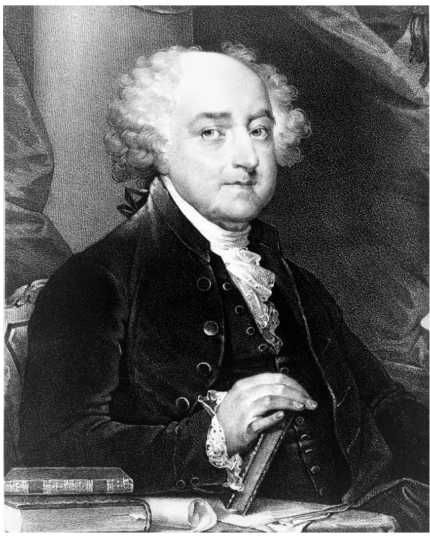
Figure 5.1 John Adams

nations by flattery or menaces, by fraud or violence, by terror, intrigue, or venality." He also listed as the "natural enemies" of the Constitution: "the spirit of sophistry, the spirit of party, the spirit of intrigue, the profligacy of corruption, and the pestilence of foreign influence, which is the angel of destruction to elective governments." While speaking of his "personal esteem for the French nation, formed in a residence of seven years chiefly among them, and a sincere desire to preserve the friendship which has been so much for the honor and interest of both nations," he pledged to continue Washington's policy of neutrality.<sup>7</sup>