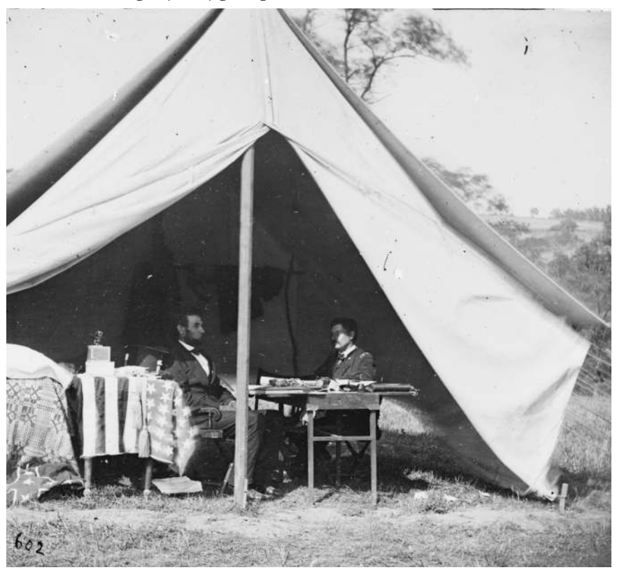
Figure 3.1 Abraham Lincoln and General George McClellan at Antietam, 1862

that the country was watching him, that "it is indispensable to you that you strike a blow. I am powerless to help this." <sup>61</sup>