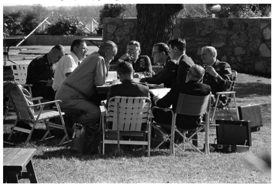
Figure 4.1 Lyndon Johnson meeting with Joint Chiefs of Staff, 1964

Angered by the apparent attacks and determined to show toughness and unity in an election year, Congress quickly passed the administration's resolution by nearly unanimous votes – 414–0 in the House, 88–2 in the Senate. The measure declared that "the Congress approves and supports the determination of the President, as commander in chief, to take all necessary measures to repel any armed attack against the forces of the United States and to prevent further aggression." It also proclaimed that "the United States is therefore prepared, as the President determines, to take all necessary steps, including the use of armed force, to assist any member or protocol states of the Southeast Asia Collective Defense Treaty requesting assistance in defense of its freedom." In a face-saving measure of dubious legality, Congress included a provision saying that the resolution could be terminated by a non-vetoable concurrent resolution of both houses of Congress.