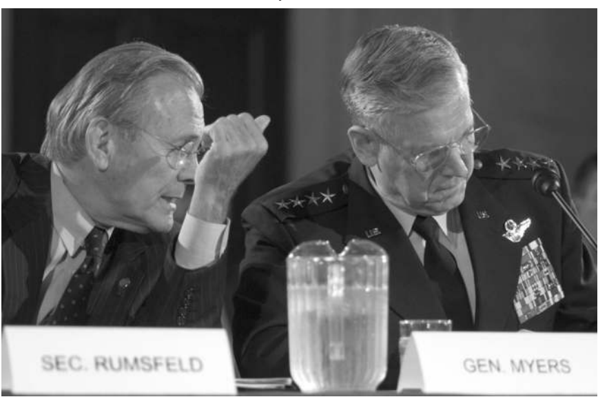
Figure 12.1 Defense Secretary Donald Rumsfeld and Chairman of the Joint Chiefs of Staff, General Richard Myers

- the first US attack on Hitler's forces - to occur before rather than just after the midterm congressional elections in 1942.