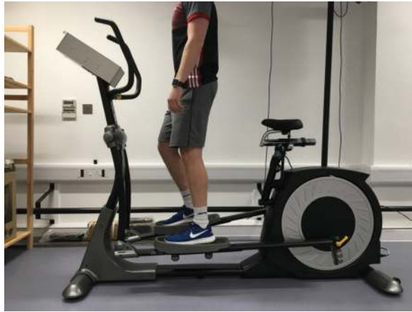
Figure 3. Current prototype of the functional readaptive exercise device.

to recruit them differentially [53]. More recently, FRED exercise has been shown to promote tonic activity of LM, assessed through measurement of superficial muscle activity using surface electromyography [58], as well as the deep lumbopelvic muscles using intramuscular electromyography [59], which is considered the most rigorous way of investigating muscle activity [60]. FRED exercise was shown to result in more selective activation of the LM and TrA muscles than over-ground walking [59], and it was found to reduce lumbopelvic movement when compared to over-ground walking, especially axial rotation of the spine [61]. To date, these studies are all based on normal terrestrial gravity, and the next step will be a clinical trial of the FRED following bed rest as a simulation of space flight. A musculoskeletal modelling study that examined the potential role of the FRED in the recruitment of lumbopelvic muscles in both +1 and 0 Gz environments, Lindenroth et al. [62] predicted that FRED exercise is able to facilitate lumbopelvic muscle recruitment in microgravity similar to how it recruits the same muscles in Earth gravity.