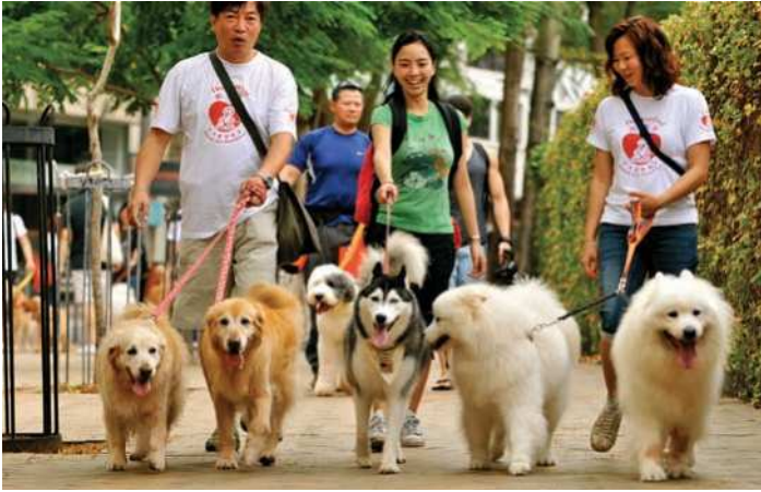
Dr. Dog handlers and their therapy dogs.