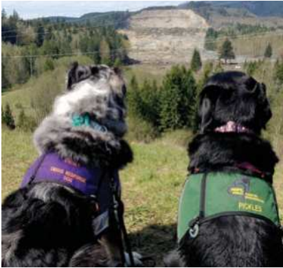
Oscar (left) and Pickles (right) pausing to take a break from their AACR work during the Highway 530 mudslide response in Oso, Washington.