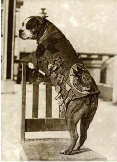
The American army dog Sergeant Stubby (ca. 1916–1926).

den on base camp and missions), and brought him up onto the deck once they were far off land so that Stubby would not have to disembark.