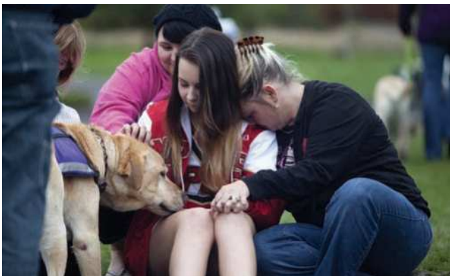
Rex, an AACR canine, joins a family at a reunification site following a school shooting.

Looking specifically at the potential long-term benefits of AACR as observed anecdotally, the comforting presence of a canine partner may facilitate trust that allows the client to begin to process his or her experience and/or loss, as well as identify coping strategies that will help the person move toward a “new normal.” For example, AACR teams may play an important role in confidential briefings for individuals who have recently lost family members in an event, and/or who are awaiting news of their