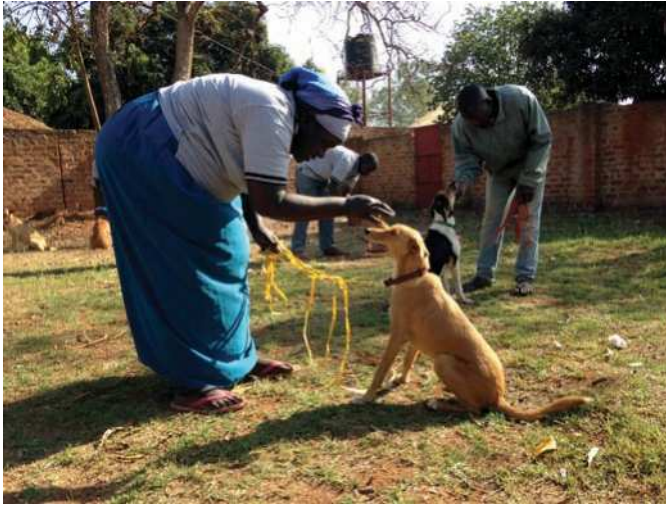
CDP participants train and work with their comfort dogs.