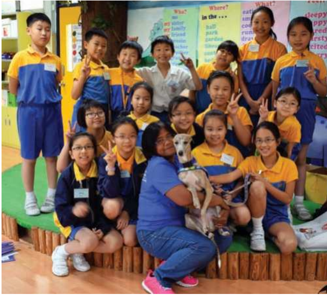
Children participate in a Professor Paws activity.

welfare focus initially, but over the years, people can see the positive change in people as well.