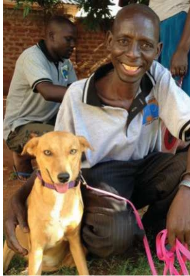
A CDP participant and his dog.