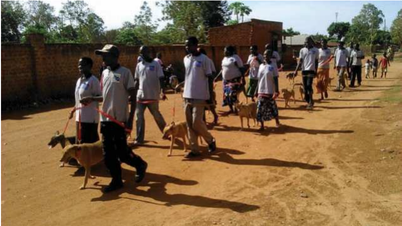
CDP participants walking their comfort dogs in Uganda.

September 14, 2016). In this way, the program not only targets the psychosocial health of its participants, but also impacts attitudes toward both mental health and dog welfare in local communities.