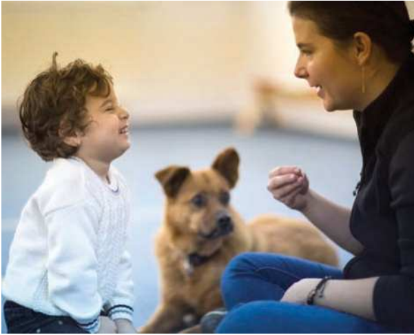
A child and psychologist work together in the presence of a stray-turned-therapy dog in Romania.

a step toward reframing the attitudes regarding animals and, consequently, their living conditions.