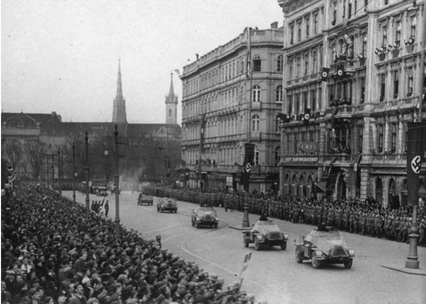
FIGURE 21 Hitler in Vienna, 15 March 1938.