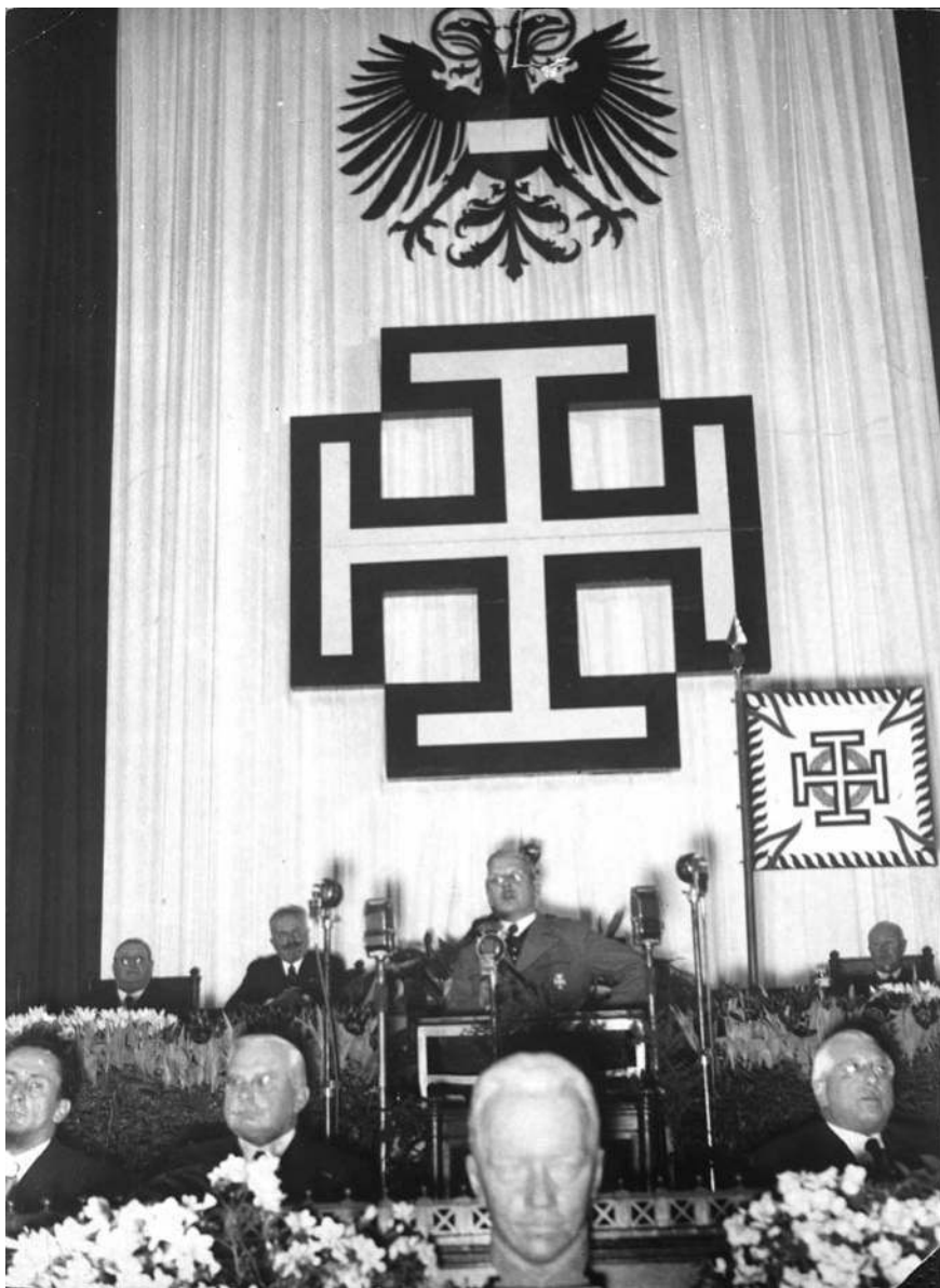
FIGURE 20 Speech of Kurt von Schuschnigg to the Bundestag, 24 February 1938.