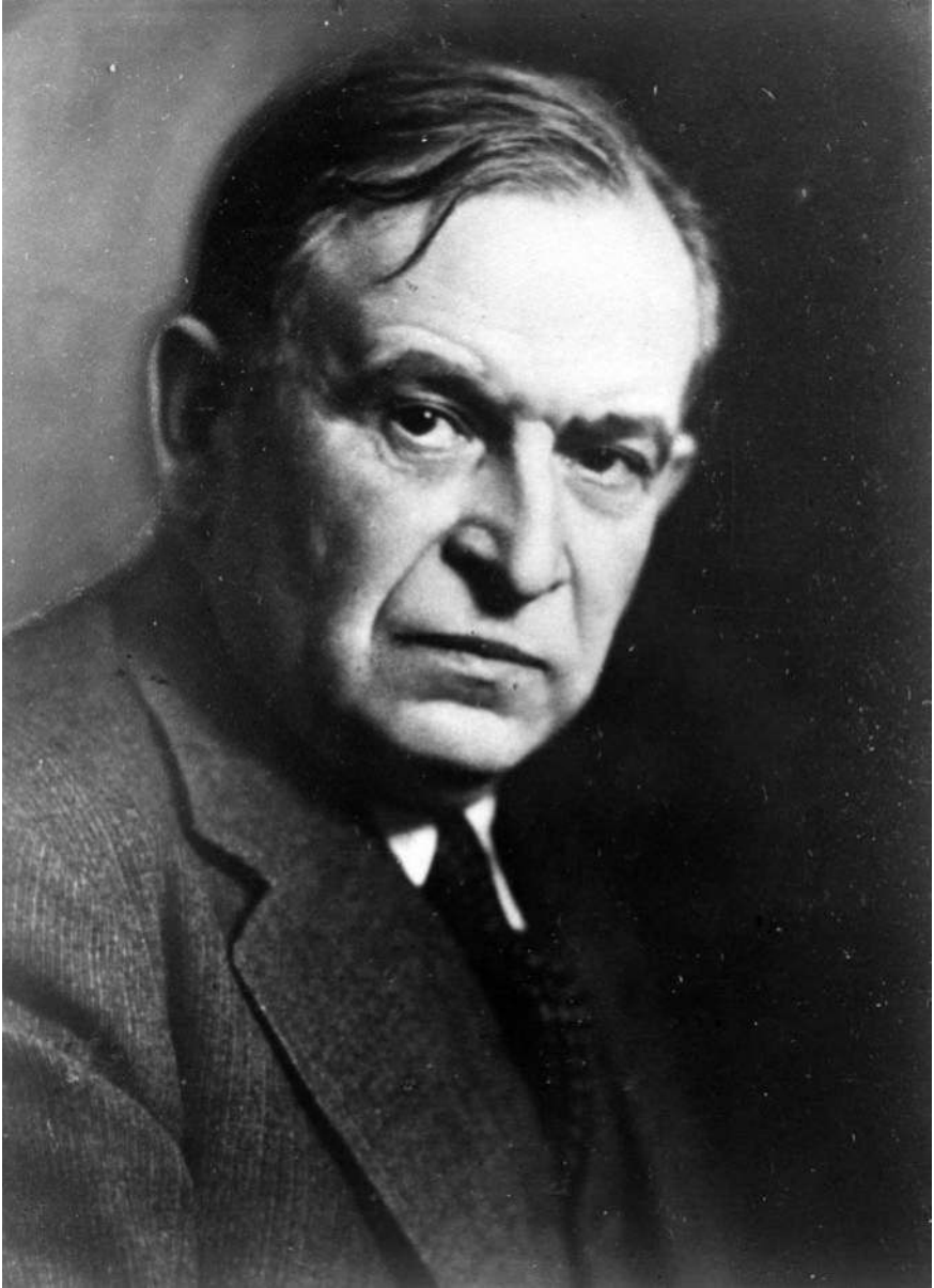
FIGURE 2 Otto Bauer ÖSTERREICHISCHE NATIONALBIBLIOTHEK, INVENTORY NUMBER: LW 75202-B.