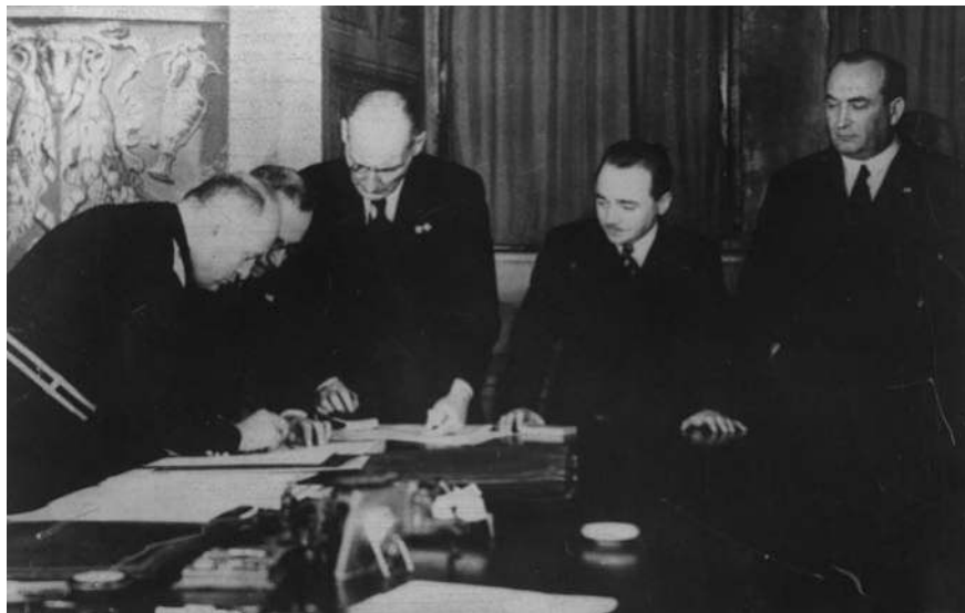
FIGURE 18 Dollfuss with Gombos and Mussolini, signing the Rome Protocols on 17 March 1934 ÖSTERREICHISCHE NATIONALBIBLIOTHEK, INVENTORY NUMBER: PF 5465 c(36)