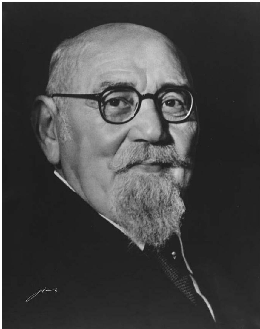
FIGURE 6 Karl Renner, First President of the 2nd Republic, around 1949 ÖSTERREICHISCHE NATIONALBIBLIOTHEK, INVENTORY NUMBER: SIM 21