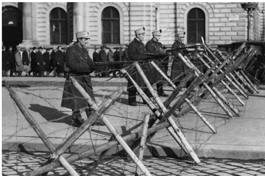
FIGURE 15 Homeguard (Heimwehr) positioned in front of the Burgtheater, 12 February 1934 PHOTOGRAPHER: FRANZ BLAHA. ÖSTERREICHISCHE NATIONALBIBLIOTHEK, INVENTORY NUMBER: E2/6