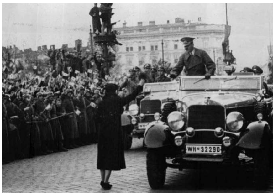
FIGURE 19 Warm welcome for Hitler in Vienna, 1938 ÖSTERREICHISCHE NATIONALBIBLIOTHEK, INVENTORY NUMBER: S 60/41