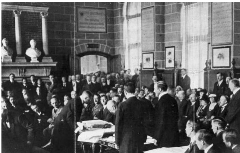
FIGURE 5 Austrian Chancellor Karl Renner signs the Treaty of St. Germain at the castle of St. Germain in 1919