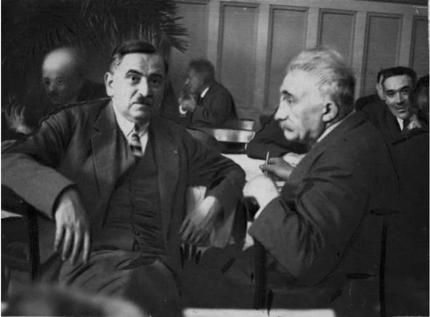
FIGURE 7 Otto Bauer (left) with Alexandre Marie Bracke-Desrousseaux during the Social Democratic Party Congress in Vienna, October 1929 ÖSTERREICHISCHE NATIONALBIBLIOTHEK, INVENTORY NUMBER: E2/6