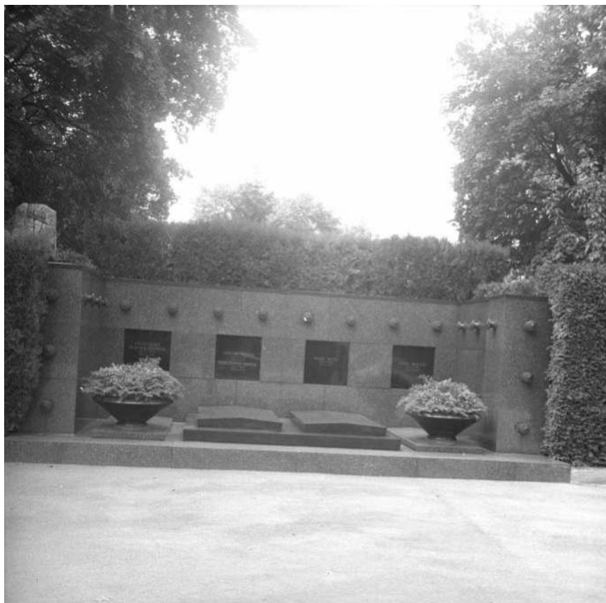
FIGURE 23 Graves of Friedrich Adler, Engelbert Pernerstorfer, Viktor Adler, Karl Seitz and Otto Bauer in the Zentralfriedhof of Vienna