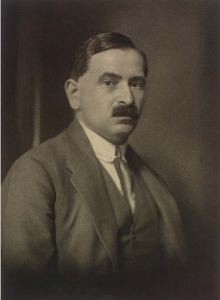
FIGURE 1 Otto Bauer around 1920

PHOTOGRAPHER: ALBERT HILSCHER OTTO BAUER. ÖSTERREICHISCHE NATIONALBIBLIOTHEK, INVENTORY NUMBER: PF 737 E1 OR H 680/1