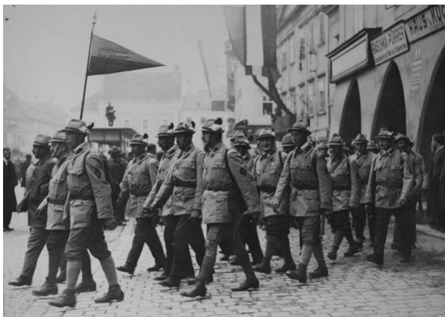
FIGURE 16 Marching Home Guard unit. Photographer: Lothar Rübelt. ÖSTERREICHISCHE NATIONALBIBLIOTHEK, INVENTORY NUMBER: RÜ Z 1282