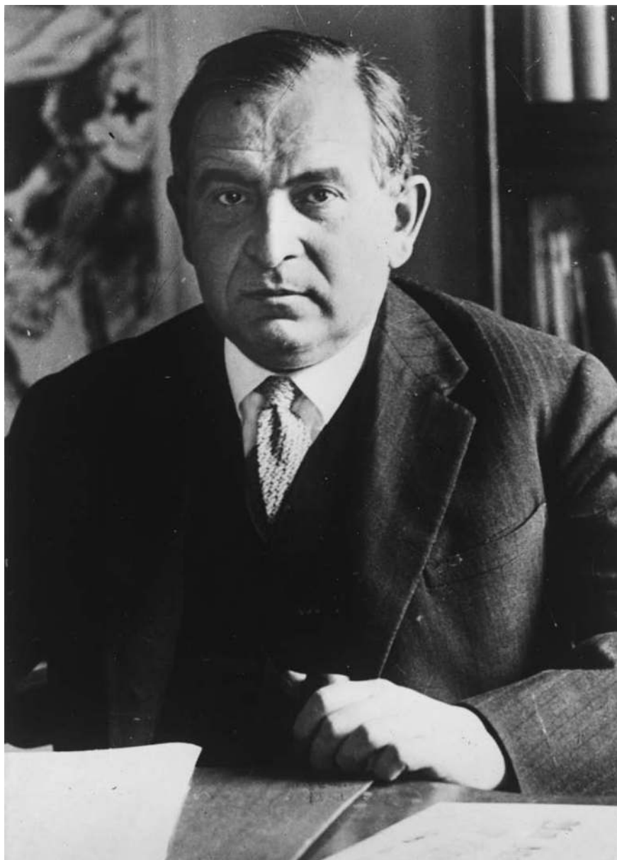
FIGURE 8 Otto Bauer in 1931

PHOTOGRAPHER: ALBERT HILSCHER. ÖSTERREICHISCHE NATIONALBIBLIOTHEK, INVENTORY NUMBER: H 680/2