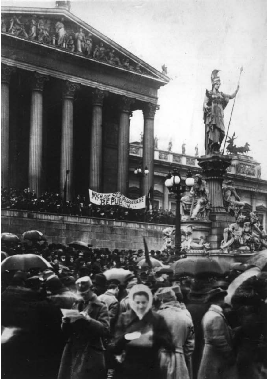
FIGURE 3 Mass demonstration in front of Parliament on the occasion of the proclamation of the First Republic of German Austria, 12 November 1918

ÖSTERREICHISCHE NATIONALBIBLIOTHEK, INVENTORY NUMBER: E10/295