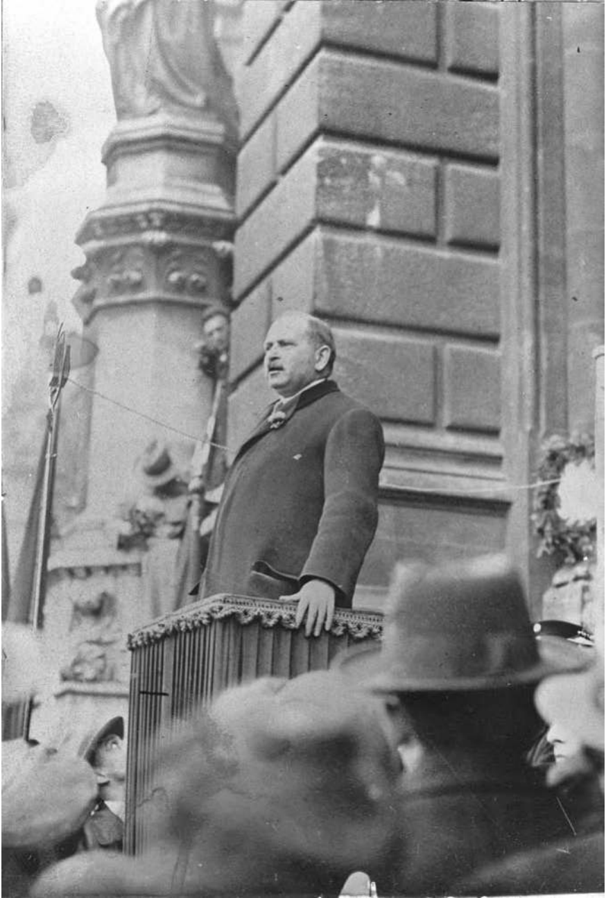
FIGURE 11 Otto Bauer in front of Vienna's City Hall around 1930 ÖSTERREICHISCHE NATIONALBIBLIOTHEK, INVENTORY NUMBER: NB 535298-B.