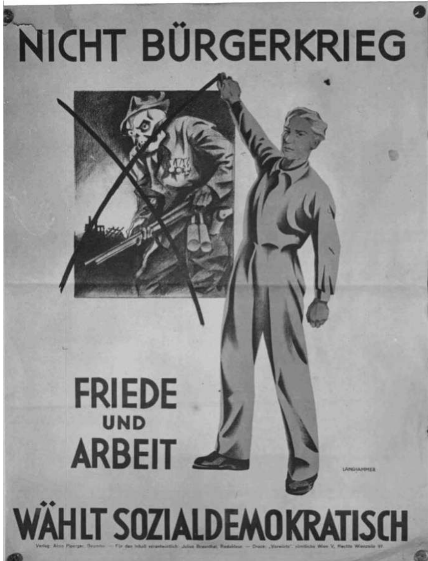
FIGURE 12 SDAP poster for the National Council elections on 9 November 1930 (text: “Not civil war / peace / and / work / vote social democratic”)

ÖSTERREICHISCHE NATIONALBIBLIOTHEK, INVENTORY NUMBER: E10/353