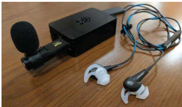
Figure 1. Depiction of design prototype.

The hardware portion of this device continuously completes the digital filtering task during the device’s operation. To do this, the Simulink code for the detector and filter has been uploaded onto a Raspberry Pi (Raspberry Pi Foundation, Cambridge, UK) to allow for alarm filtration. A microphone connected to the Raspberry Pi obtains and passes the environmental sound to the digital detector ( Figure 1 ).