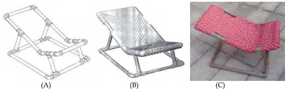
Fig. 10. (A) and (B): PVC pipes and connections structure; (C) Final craft model.