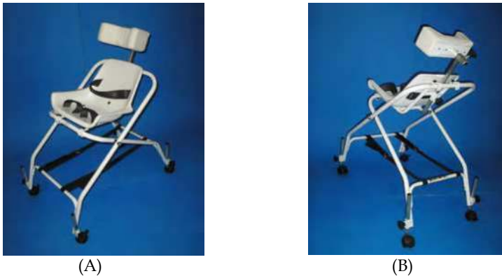
Fig. 7. Infant bath chair: (A) anterolateral view; (B) posterior-lateral view.

Other bath chair models (Figures 7 and 8) are designed to serve severe motor impairment users also have similar aspects, differentiating in some structural features, design and accessories. They are products whose tubular structure is often made of aluminum and the seat and back set consists of a polyurethane shell form-fitting, with or without holes, whose function is let the water flow during bath or shower.