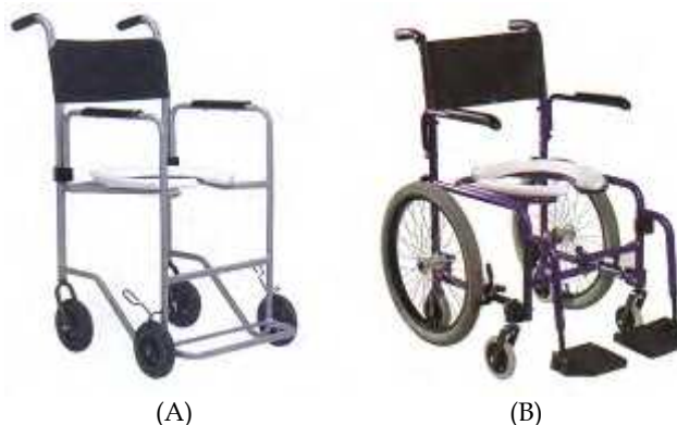
Fig. 3. Adult aluminum shower bath chairs: (A) Fixed structure and (B) Folding structure for closing.

the position of the head against gravity; moreover, the bending system of the seat and back group ("tilt") of up to 35^\circ allows a better accommodation for a person with absent or insufficient trunk control, who are unable to remain seated without support.