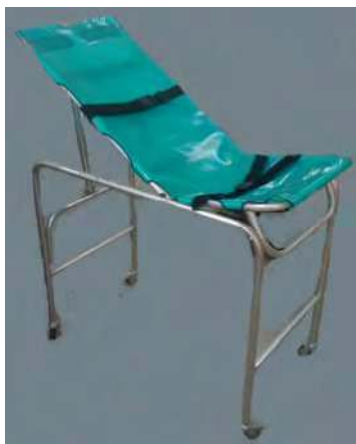
Fig. 5. Bath chair with recline tilt system.

Among these AT devices aimed for bathing or showering that have specific features to the demands imposed by more severely handicapped users, there are other models whose dimensions meet more specifically children and teenagers. These models, in their own constitution, usually have a range of resources appropriate to meet some specification, such as lack of motor control, including absence of neck control, insufficiency or default of trunk control, persistency of primitive reflexes and/or involuntary movements difficult to control, a situation that is compatible to people that with cerebral palsy or other disease that seriously compromise the musculoskeletal system.