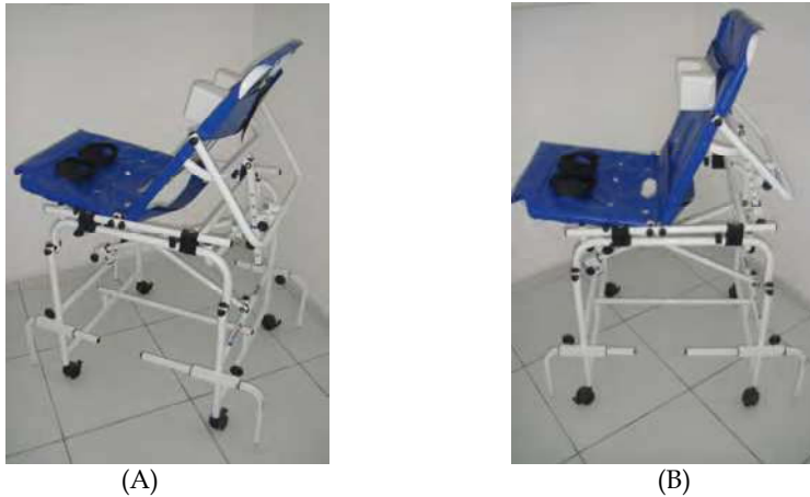
Fig. 6. Youth bath chair: (A and B) Removable base with height adjustment and belt and headrest system.

Other bath chair models (Figures 7 and 8) are designed to serve severe motor impairment users also have similar aspects, differentiating in some structural features, design and accessories. They are products whose tubular structure is often made of aluminum and the seat and back set consists of a polyurethane shell form-fitting, with or without holes, whose function is let the water flow during bath or shower.