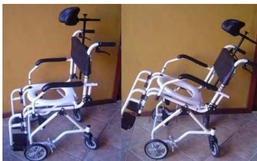
Fig. 4. Aluminum bath chair with backrest and headrest tilt system.

The presence of arms and legs support, which might be retractable or removable, supplement the necessary resources that permit a better accommodation of the user. Although the equipment presents more adequate features, the needs of more severely compromised people in the physical aspect, and the possibility of changing the adult toilet seat to a child one, implies that the dimensions offered by the equipment makes its designation more appropriate especially to adults.