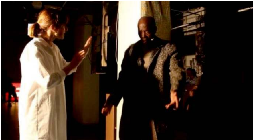
Fig. 5: Confrontation between the medical doctor and the artist.