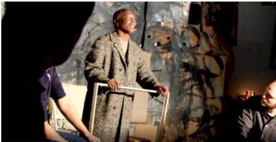
Fig. 3: The artist attempts to escape from his mental health crisis through the performance of song.

Later playing the role of a traditional healer, he unarchives ancestral knowledge on traditional medicine when later in the performance he educates the German medical doctor, who eventually travels to Tan-