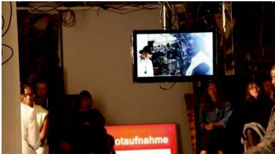
Fig. 4: The moment of "interrogating" the patient.

Although he speaks only in order to voice his opinion on the consequences of anti-psychotics on his body, his silence equally communicates nostalgic feelings that translate into resilience and revolt not only against an individual, but correspondingly against a system that,