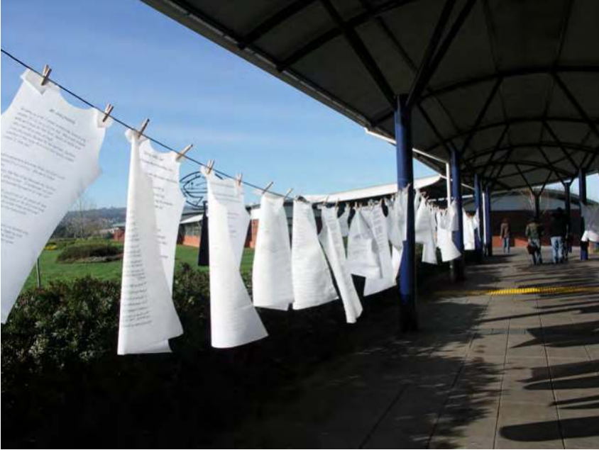
Women hang their health concerns out to dry at the Women on Top Health Forum, Launceston, June 2008.