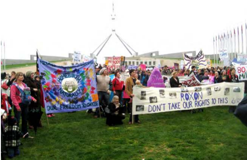
The 'Mother of All Rallies', organised by Maternity Coalition. Approximately 3000 women demonstrate in support of expanded maternity-care choices outside Parliament House, Canberra, 7 September 2009.