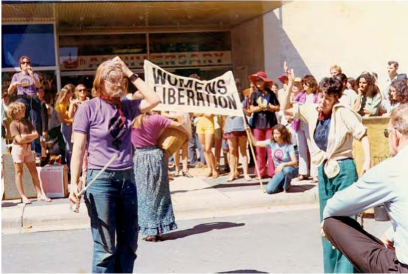
Canberra Women's Liberation presenting street theatre, International Women's Day, 1972.