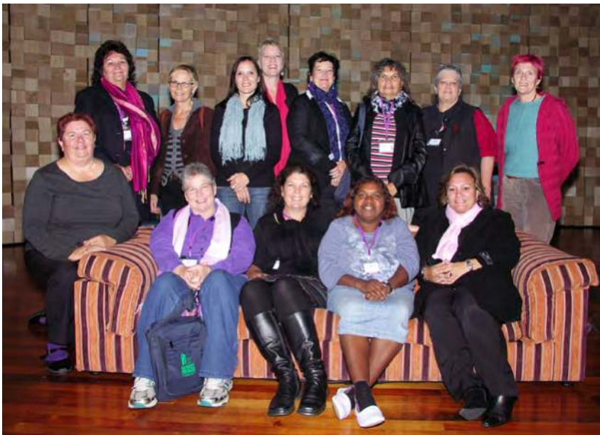
An NT contingent at the Sixth AWHN National Women's Health Conference, Hobart, 2010.