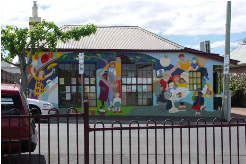
Hobart Women’s Health Centre.