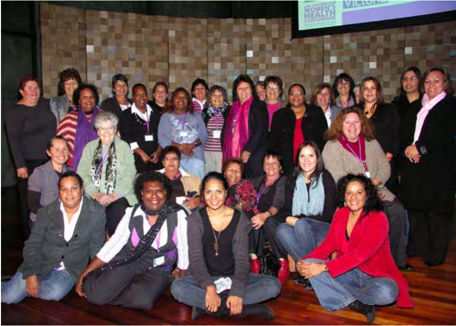
Members of the AWHN Aboriginal Women's Talking Circle at the Sixth AWHN National Women's Health Conference, Hobart, 2010.