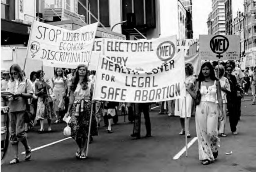
WEL-NSW members marching against the ‘Lusher Motion’, a Bill moved by MP Stephen Lusher in the House of Representatives to restrict the payment of medical benefits for termination of pregnancy, International Women’s Day, 1979.