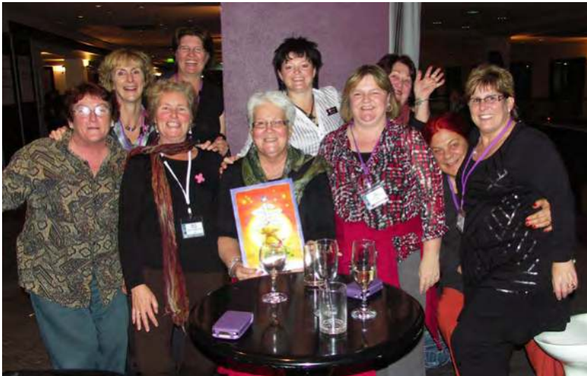
A Western Australian contingent at the Sixth AWHN National Women's Health Conference Party, Hobart, 2010.