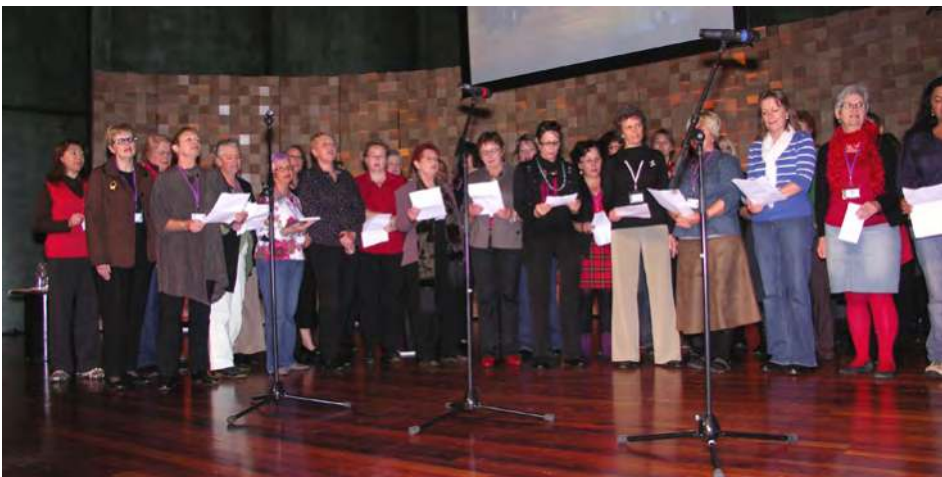
The Sixth AWHN National Women's Health Conference Choir, on stage, Hobart, 2010.