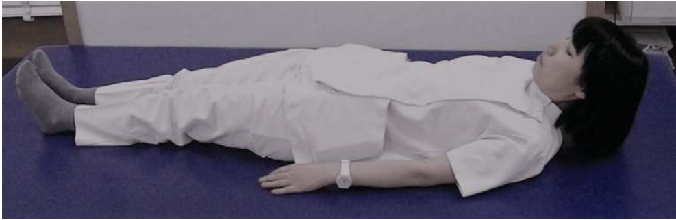
Figure 3. Shaker exercise. Lying on a bed and raising the head without lifting the shoulder, while looking at the toes.