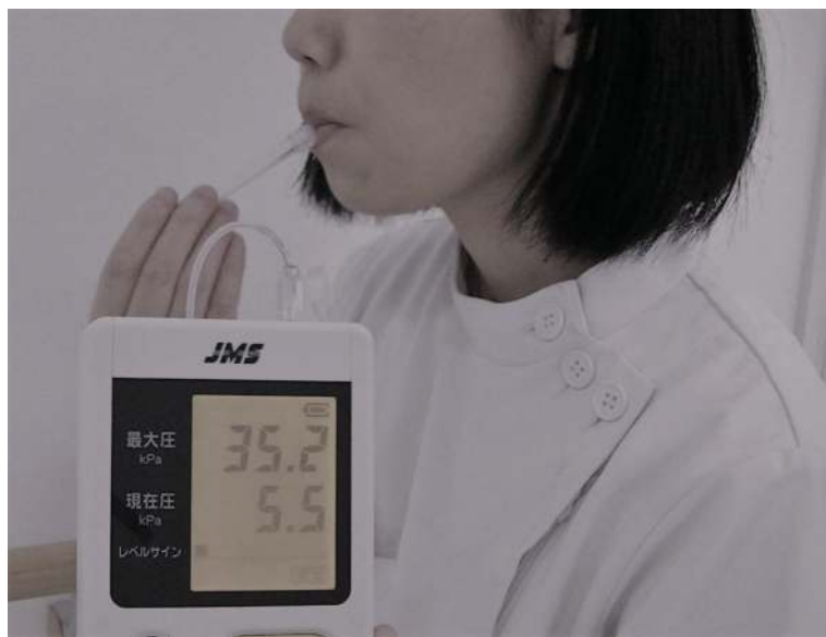
Figure 2. Tongue strength measurement. Compressing an air-filled bulb between the tongue and the hard palate and displaying the maximum tongue strength at the upper row (JMS, Hiroshima, Japan).

The effectiveness of the Shaker Exercise for strengthening the suprahyoid muscles is well-known in the field of dysphagia rehabilitation. The Shaker Exercise consists of an isometric component comprising three head lifts for 60 s each with a 60-s rest period between two consecutive head lifts and an isokinetic component comprising 30 consecutive head lifts at constant velocity ( Figure 3 ). Shaker et al. [84] and Easterling [85] examined the effect of this