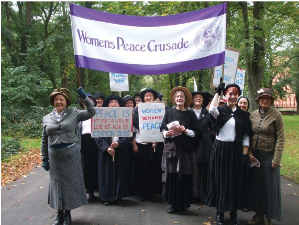
Figure 6.5. Peace Crusade Choir, 2018.

In Manchester, England, in 2014, a group of local volunteer researchers decided to explore alternative narratives of the years 1914–18 using the city and the surrounding textile towns of the North-West as examples of local and individual sites of resistance to the war. Many of the anti-war women in the North-West were under surveillance by the Special Branch and MI5, and a number of women were imprisoned as a result of their anti-war activities. Of course, there was sizeable opposition to the war across the country and a local, regional and national network of anti-war activists existed, but this research enabled an exploration of the networks of local resistance in more depth and the creation of spaces to commemorate this resistance. The research shone a light on the largely forgotten Women's Peace Crusade (WPC) which, although a national campaign, spread like wildfire through the industrial north: one of its main protagonists was Selina Cooper from Nelson. Firstly, a film was made about the Crusade with more than 100 volunteers from Manchester, Blackburn, Bolton, Rochdale, Oldham and Nelson who acted in the film, and twenty researchers who pored over local archives and newspapers to discover some of the socialist women active in each town: Lydia Leach from Blackburn, Elsie Winterbottom from Oldham, and Gertrude Ingham and Selina Cooper. As part of a process of commemoration, a group of