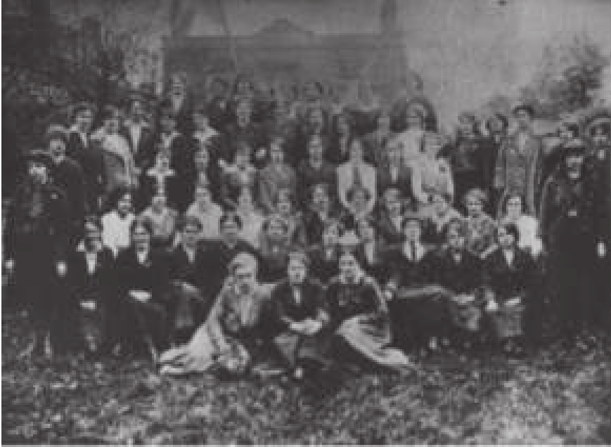
Figure 6.7. Revolutionary women of Easter 1916, Dublin, autumn 1916, reproduced with permission of Kilmainham Gaol Museum.