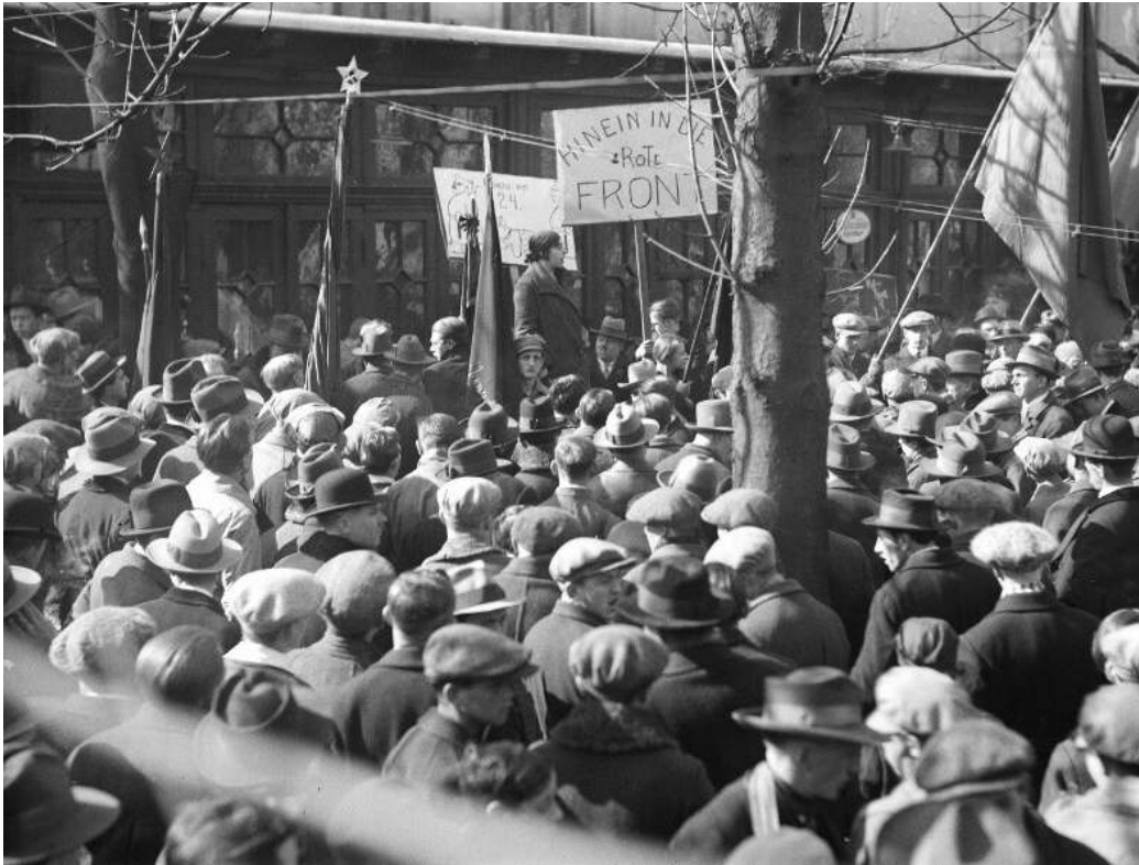
Figure 5.1. A woman addresses a communist demonstration in Vienna, 1929.