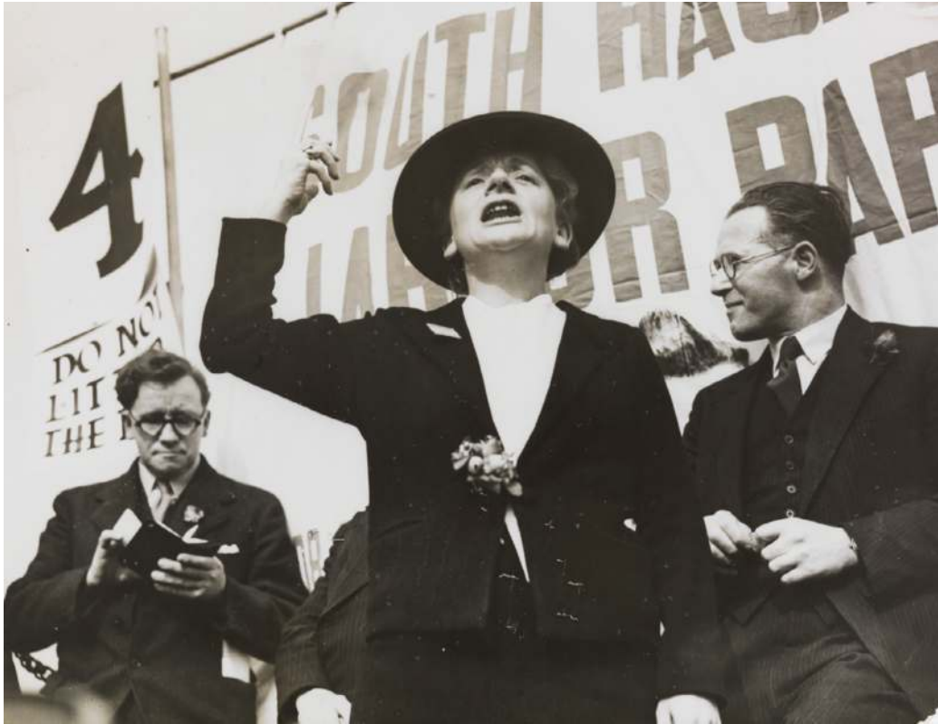
Figure 4.5 Ellen Wilkinson (1891–1947), MP, speaking at Labour’s London May Day Celebration in Hyde Park, 1939. Wilkinson was Labour Party MP for Middlesbrough East (1924–31) and Jarrow (1935–47) and Minister of Education (1945–7).

ideas. In Manchester there was a competition for a ‘womanchester’ statue which was won outright by a public vote for Emmeline Pankhurst whose move to London in 1906 and pro-war stance were hardly mentioned. At the time of writing, there is a small but vocal campaign to get recognition for the other five shortlisted women: Margaret Ashton, 1856–1937, who was the first woman councillor, suffragist and pacifist; Elizabeth Gaskell, 1810–65, novelist and champion of the poor; Louise Da-Cacodia, 1934–2008, anti-racist campaigner and activist; Labour politician and suffragist Ellen Wilkinson, 1891–1947; and eighteenth-century entrepreneur Elizabeth Raffald, 1733–81.