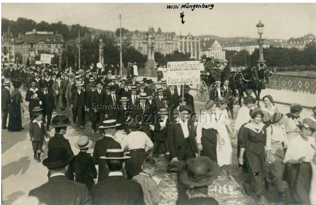
Figure 2.1 Anti-war demonstration on the Quai in Zurich, March 1915. Willi Münzenberg (wearing a flat cap) is standing directly in front of the banner which reads: 'Girls! Boys! Join the Free Youth'.

had diverse impacts on its society and politics. As a neutral country in the centre of Europe, it was an important refuge for deserters and draft-dodgers and attracted pacifists and socialists from all over the continent. Indeed, Lenin and Nadeschda Krupskaja, Inessa Armand, Willi Münzenberg, Angelica Balabanova and others spent some years in Switzerland during the war. 18 There was also a home-grown anti-war movement with especially strong links to Germany. Thus extracts from Zetkin's November 1914 appeal to socialist women of all countries to position themselves against the war was first published on 1 December 1914 in the Swiss Social Democrat women's newsheet Die Vorkämpferin ( The Female Pioneer ), its German equivalent, Die Gleichheit (Equality), being unable to print it at all due to censorship restrictions. 19 Shortly thereafter, it was published in full in the Berner Tagewacht , a Swiss daily newspaper which was then still available for purchase in Germany. 20 Meanwhile, Die Vorkämpferin , taking advantage of the lack of pre-publication censorship in Switzerland, sponsored a number of women's peace assemblies in the winter of 1914–15. After an anti-war demonstration in Zurich on 18 December 1914, it reported that as well as large numbers of men, 'over one thousand women' had taken part. 21 Another demonstration, held in March 1915 under the slogan 'Girls! Boys! Join the Free