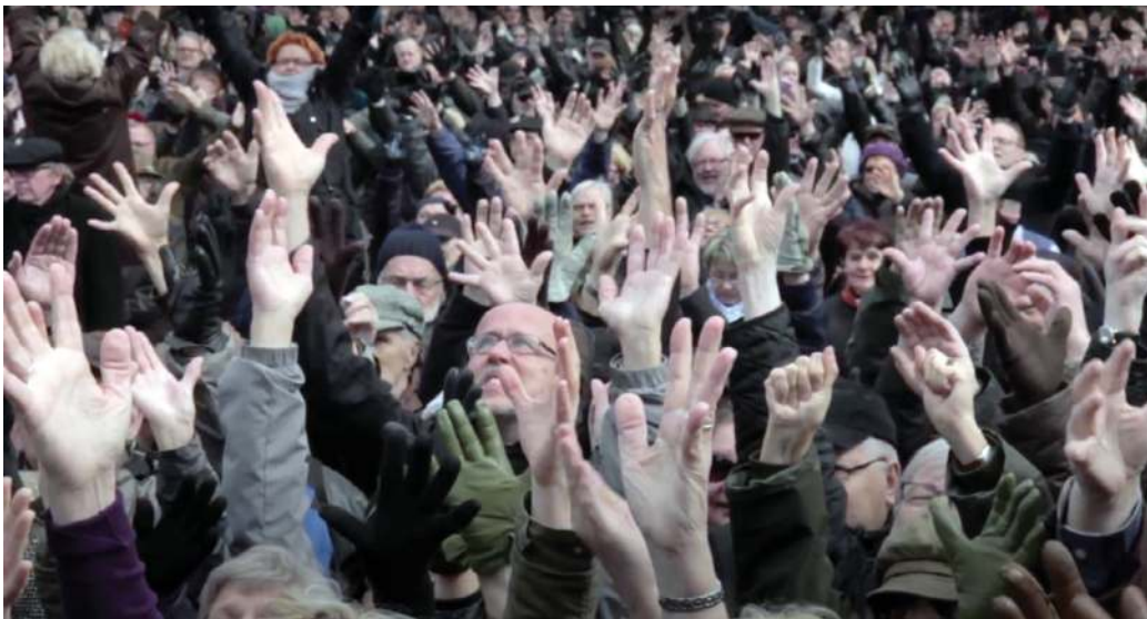
Figure 6.4. This picture is a still frame from the documentary film Fellman's Field (in Finnish Fellmanin pelto ) by Kaisa Salmi. In 2013, artist Kaisa Salmi directed a performance called Fellman's field – monument of 22,000 people . The event was attended by more than 10,000 people from all over Finland. The immersive performance was based on the events in the civil war's largest prison camp, where 22,000 Red prisoners spent several days in poor conditions on this same field waiting for their hearings. Reproduced with permission of the artist Kaisa Salmi.

In Finland, the civil war has also been dealt with through various immersive events. For example, artist Kaisa Salmi produced Fellman's Field – A Living Monument of 22,000 People as a work of performance in Lahti on 28 April 2013. Here it was staged in the same field where 22,000 Red women, men and children had waited for their interrogation and sentencing for six days in April–May 1918. The performance was attended by thousands of people, united by a desire to remember the victims of the civil war and reconcile the injustices that took place. The reception of the event was controversial. Some thought it was tearing open old wounds for no good purpose. 65