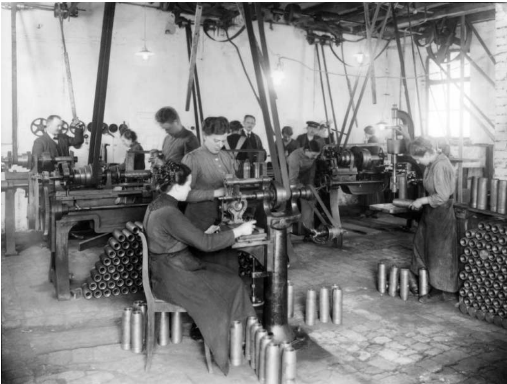
Figure 2.2 Women working in an arms factory, c. 1917, place unknown, Germany.

The image of the war presented here was, on the one hand, of an all-encompassing conflict that suited the interests of capitalists and arms manufacturers in every European country, not just belligerents, and conflicted with the interests of workers everywhere. On the other hand, it was also a view from the edges, laying bare the suffering caused by the war on a smaller scale, particularly as it affected women and children, and channelling the possibility of protest into the specific, the immediate and the everyday. As Toni Sender, one of the German delegates at Bern and a future Social Democratic Reichstag (parliamentary) deputy for the city of Frankfurt am Main, put it, the war had to be stopped and sovereignty