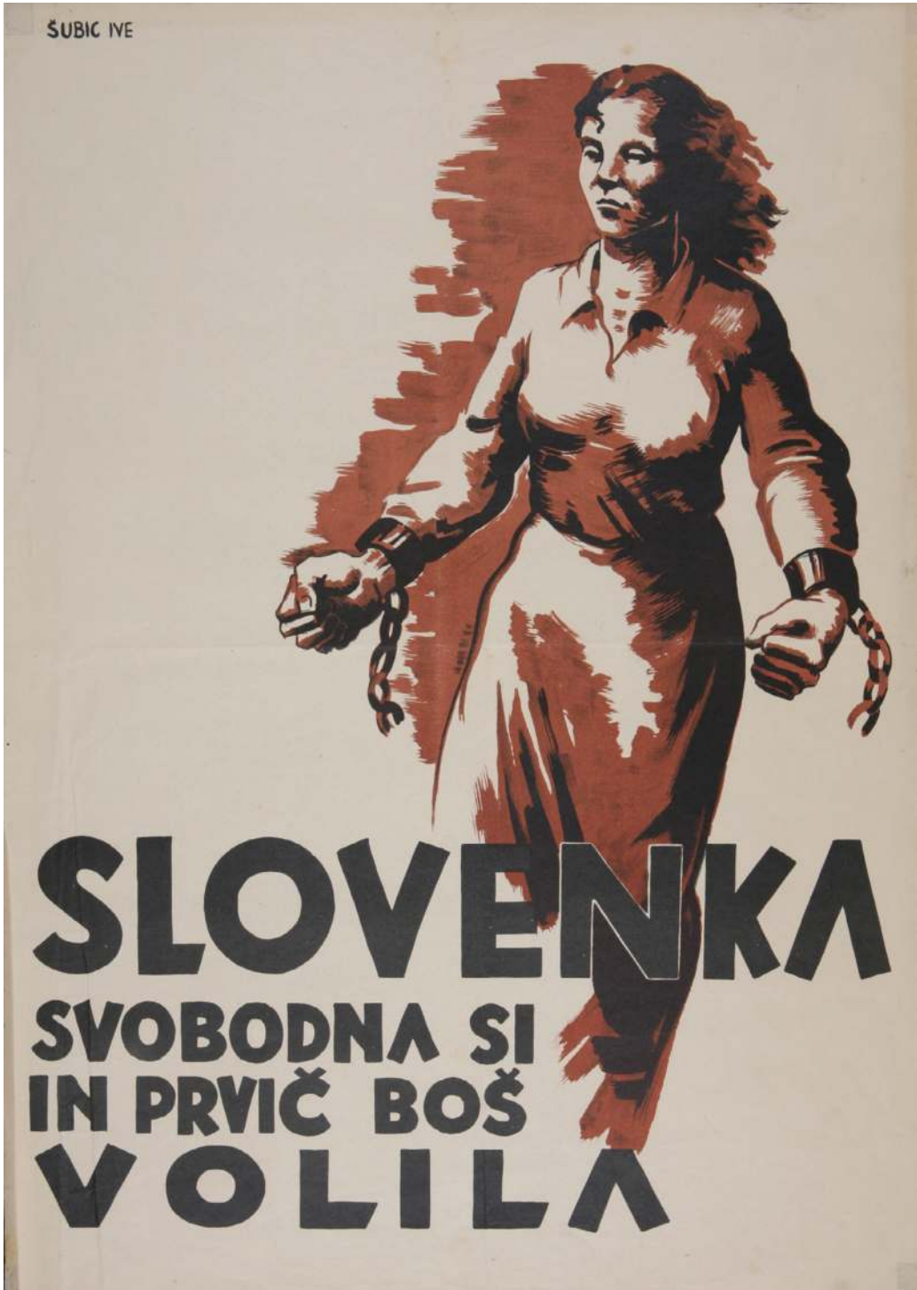
Figure 4.1 Ive Šubic: 'Slovenian woman, you are free and you will vote for the first time', poster, 1944.