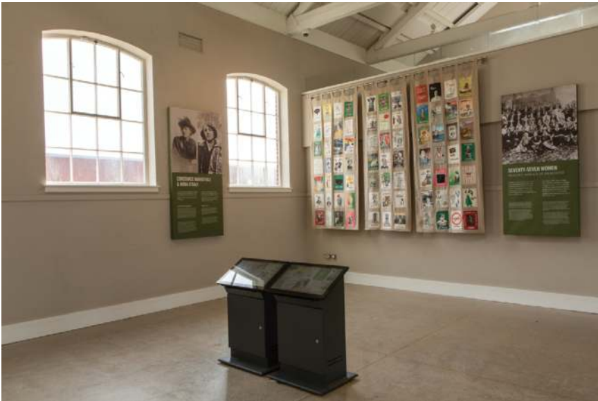
Figure 6.8. The ‘77 women’ of 1916 quilt, Richmond Barracks Exhibition, 2016, reproduced with permission of Richmond Barracks

collaborative effort between a group of feminists, academics, activists and artists who came together as a planning subgroup during the development phase of the Barracks. 105 This subgroup engaged academics to research and write the book on the seventy-seven Easter Rising women, and a local artist to work with seventy-seven local activists to create a commemorative quilt.