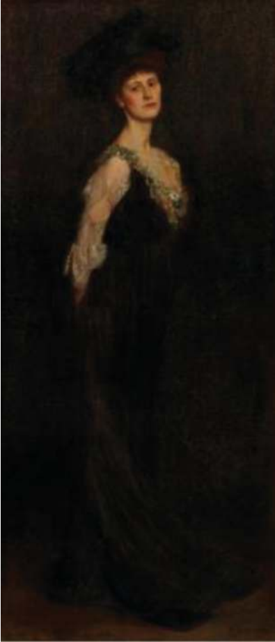
Figure 6.1. Boleslaw von Szankowski's portrait of Countess Constance Markievicz, 1901, reproduced with permission of the Hugh Lane Gallery, Dublin.