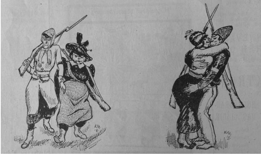
Figure 3.4 Cartoon mocking Red female soldiers in the Finnish satirical paper Nya Fyren , no. 5–7 (1918).

because the enemy in the civil war was a fellow citizen, possibly even one's neighbour or relative. The propagandists used stereotypes to create boundaries between the 'acceptable' and the 'detestable'. This dichotomy increased a sense of solidarity among 'normals' and eased the exclusion of 'abnormals'. 108 In White newspapers, four stereotypes were used to represent Red women. Nurses were called 'Sisters of free love', implying that they were on the front solely in order to indulge in sexual excesses. Finnish women who dated Russian soldiers were 'Russian brides' and were seen as traitors to the nation's purity. Red mothers were labelled as 'sources of evil' since they had raised sons who became rebels. They were even accused of being culpable for the whole war as a Red woman was 'the exact opposite to everything that she as a mother and as a wife should be. Such a woman should not be allowed to raise her children'. 109 The female soldiers were called tigresses as they were considered to have lost contact with their femininity and humanity and turned into beasts as they grabbed rifles. Immorality, be it sexual or otherwise, was common to all four stereotypes. Untrue rumours were spread, for instance, that Red nurses killed White patients in hospitals, 110 and female soldiers were disgraceful cowards and traitors: