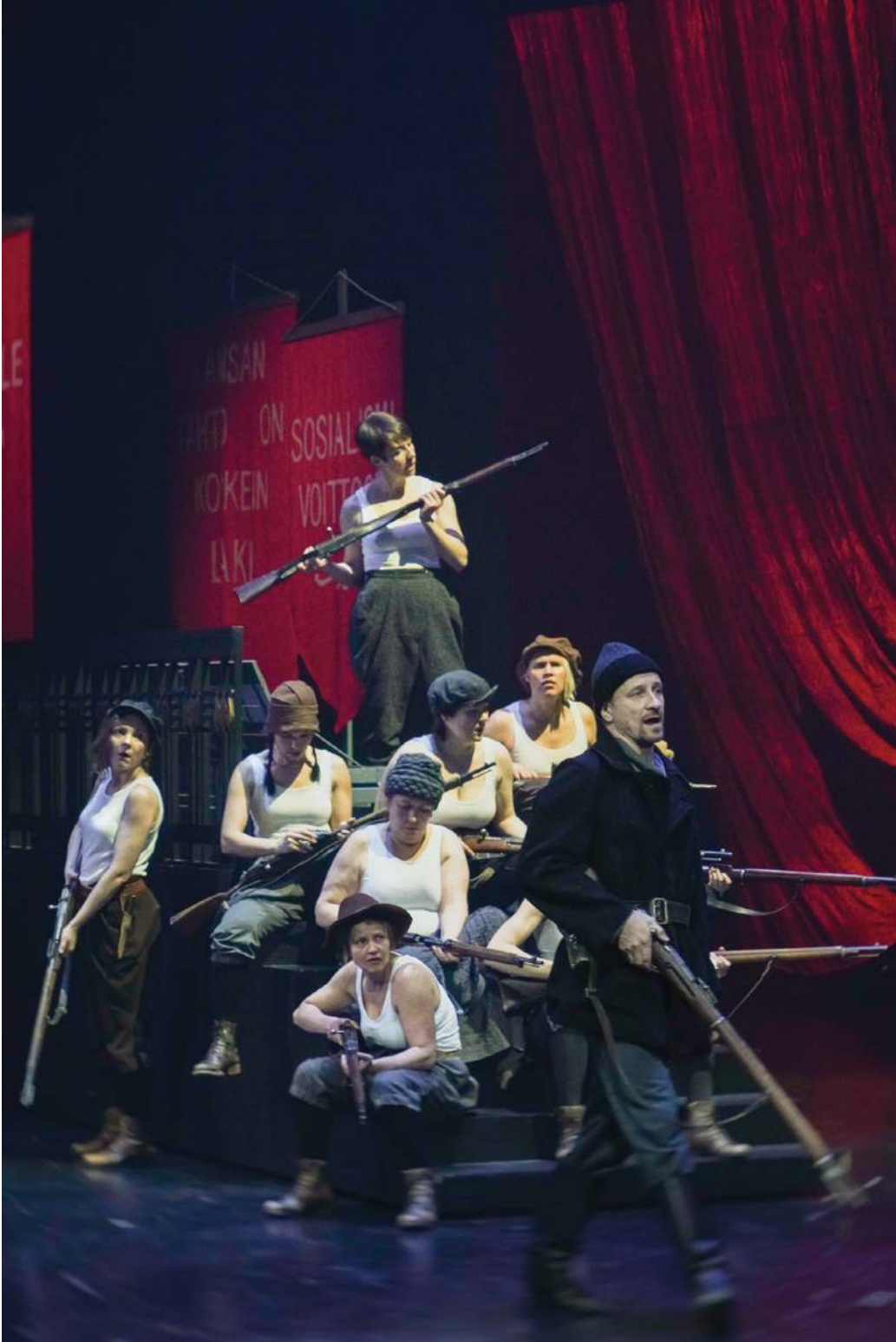
Figure 6.3. Grim memories and harsh experiences of a civil war will always overshadow a nation for a long time. The means of both research and art are needed to dismantle the national burden of the war. In Finland, in the Tampere Workers' Theatre the brutal destinies of young female soldiers were the focus of the musical Girls 1918 . The distinctive feature of this musical was the combination of dark historical stories and modern rap music.