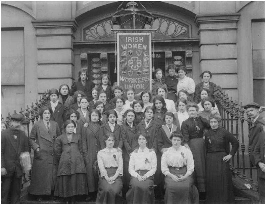
Figure 1.2 Members of the Irish Women Workers’ Union on the steps of Liberty Hall, Dublin, during the lock-out strike of 1913–14.

Violent clashes also took place between male and female strikers and the forces of ‘order’ in Habsburg Trieste during the general strike in February 1902, Barcelona during the ‘tragic week’ ( Setmana Tràgica ) in July 1909, and the Emilia-Romagna and Marche regions of Italy during the ‘Red Week’ ( Settimana