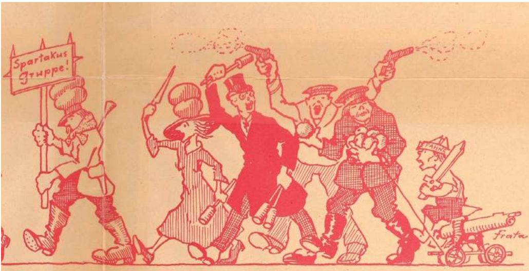
Figure 3.5 'Wen wähle ich?' ('Who do I vote for?'). German propaganda poster, 1919, promoting the Majority Social Democrats while warning against the dangers of the Spartacist movement represented by a dishevelled and armed woman in the front row.

In Germany, a reading of the politically conservative press gives further insight into the different aspects of the phantasma of the revolutionary woman, denying the political nature of feminine involvement. Spartacist women were described as amoral and sexually depraved. They are for example often referred to as prostitutes storing weapons in their homes and participating in looting. Districts under the control of the revolutionary side, like Berlin's Lichtenberg in March 1919, were described as being infested with 'nests' of Spartacists, 114 forming a veritable 'Bolshevik menagerie.' 115 The left-liberal Berliner Tageblatt carried a report on its front page on 19 January 1919 about 'the hustle and bustle of Spartacists [who] celebrated real orgies with women from the surrounding area. [It] was so bad that hardly anyone dared to leave the house afterwards.' 116 On the same day, the Tägliche Rundschau reported how five women were killed at the Silesian railway station 117 because they dared to 'resist to the advances of the Spartacists', 118 hence portraying revolutionaries as sexual predators. 119 These