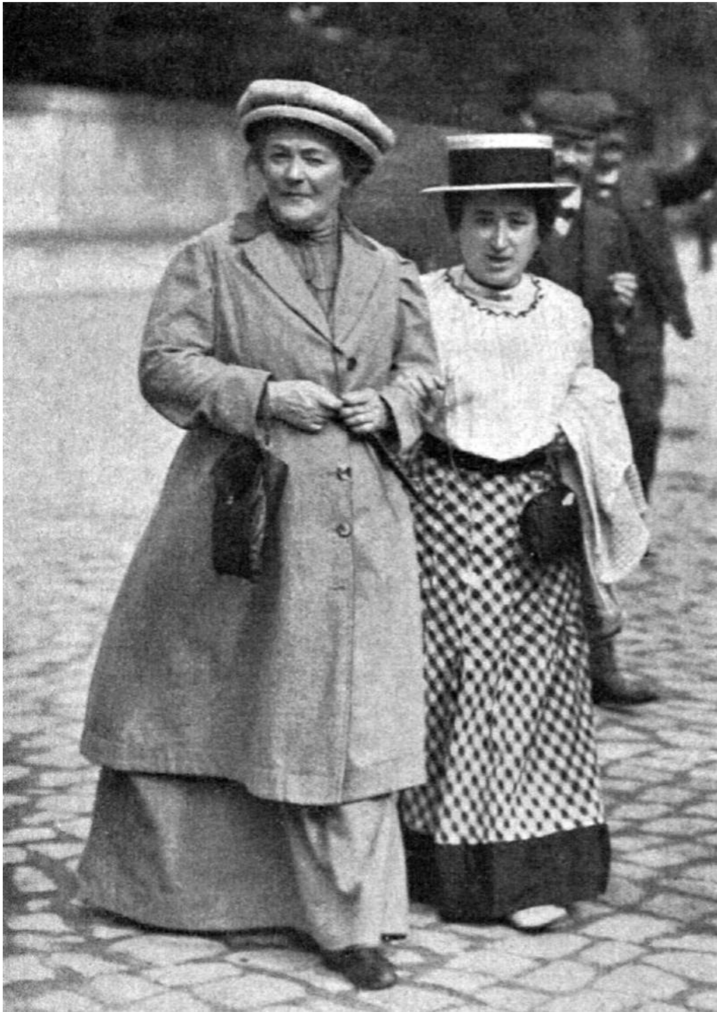
Figure 4.2 Clara Zetkin (1857–1933) with Rosa Luxemburg (1871–1919), 1910.