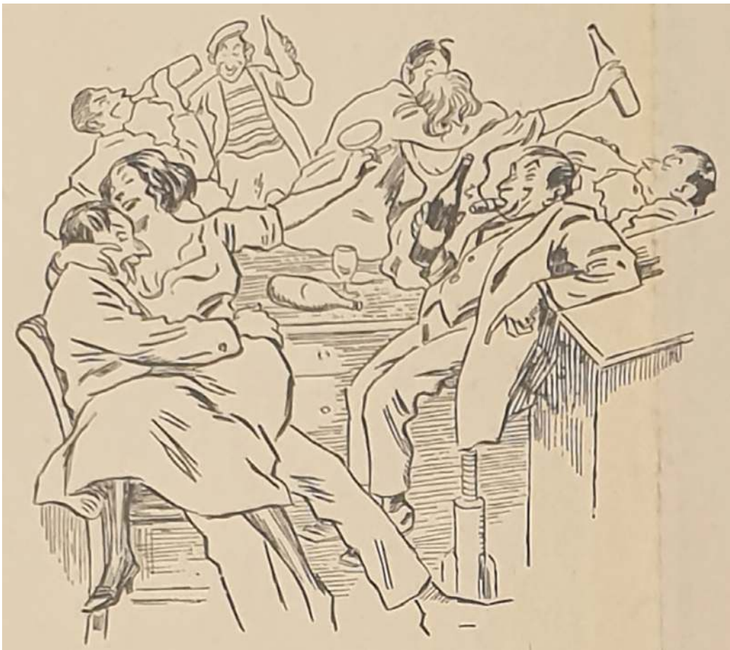
Figure 3.1 Propaganda poster against the Munich Republic of Councils showing drunken revolutionaries indulging in orgiastic pleasures, 1919.

workers playing a prominent role. 32 In October 1918, sailors' mutinies broke out in Wilhelmshaven and Kiel, as was already the case throughout the Habsburg Monarchy in the course of the summer of 1918. The sailors were quickly supported by the local working population. Soldiers' and workers' councils soon spread to the rest of the country. The empire collapsed and on 9 November 1918, the Social Democrat Philipp Scheidemann announced the foundation of the Republic from the balcony of the Reichstag. While the Kaiserreich expired without bloodshed or a sudden surge of violence, the battle over the city palace ( Berliner Schloss ) on Christmas Eve 1918, and further street fighting in the early months of 1919, nearly put Berlin in a state of civil war. Indeed, the left-wing forces of the Independent Social Democratic Party (USPD) and the newly formed Spartacists wanted to carry on with the revolution and called