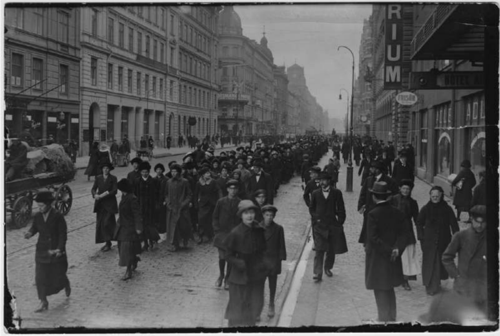
Figure 2.5 Women's 6,000-strong hunger march, here passing along Vasagatan, one of Stockholm's central thoroughfares, en route to the Milk Central, 26 April 1917.

events and the activities by other women these had triggered around the country, as well as the big demonstration in front of the Riksdag on 21 April – downed tools and set out on a march to the Milk Central to protest against the high prices for dairy products. They poured out of the Stockholm shoe factory, the Munich brewery, the Tobacco monopoly, the Barnängen textile factory, the Liljeholmens jersey factory and many others – until they were 6,000-strong. 117 A newspaper reported that even 'a large number of workers' wives and half-grown girls with braids on their backs' joined the large mass of women. 118 The Swedish hunger demonstrations are today considered to be the largest social protest movement in the country's recent history.