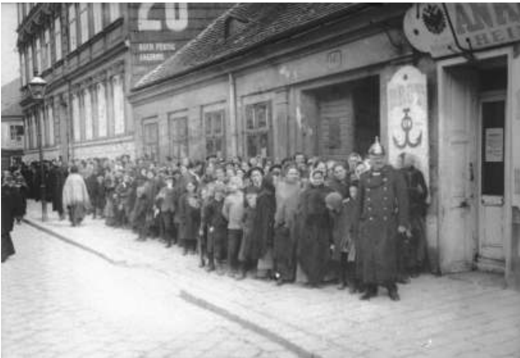
Figure 2.3 Women and children queuing for bread in First World War Vienna, exact date unknown.

Those who did participate in anti-war protests after 1914 typically had some prior experience of class struggles, albeit less through the socialist parties and unions organized by men and more through community-based forms of confrontation with authority. 33 During the war, this also made them well-placed to experience feelings of solidarity with teenagers, war cripples and soldiers unwilling to go back to war after periods of leave, as well as enemy POWs. 34 Those women who stayed working in the traditionally female-dominated textile industry instead of moving into munitions, for instance, in parts of Saxony,