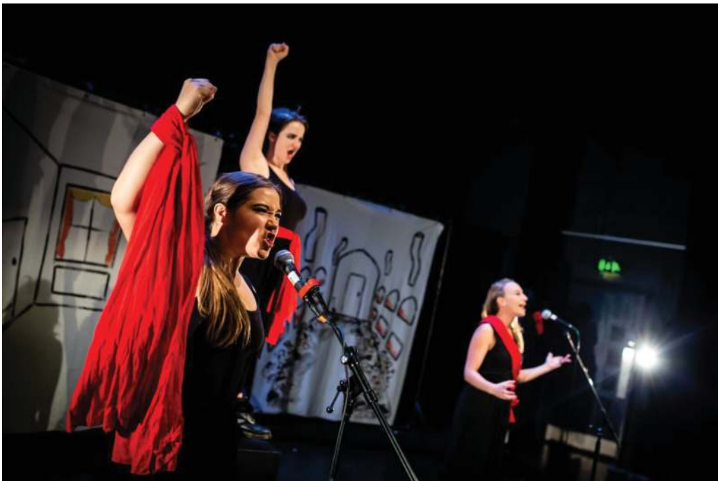
Figure 6.6. Rehearsal image from Women of Aktion by Bent Architect, 2018, photography by and permission from Karol Wyszynski.