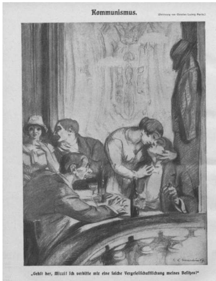
Figure 3.6 Cartoon ‘Kommunismus’ in the Austrian satirical paper Die Musquete , 13 March 1919, equating the socialization of property with free sexuality and/or women with property.

The Social Democrat Hilja Pärssinen, a member of the Finnish Parliament since 1907, had to flee the country to Russia and then Estonia after the defeat of the