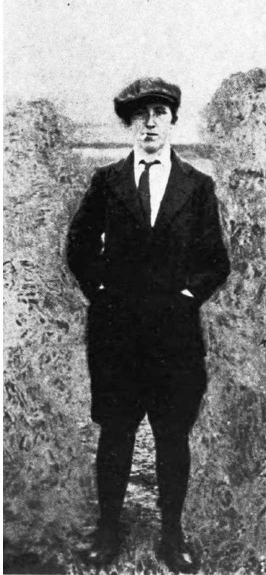
Figure 3.7 Irish socialist and revolutionary Margaret Skinnider, 1915.

opposed the Treaty which led to the settling up of the Irish Free State, of which Skinnider was one, would not get pensions, it officially denied Skinnider the pension on the basis that ‘the Army Pensions Act is only applicable to soldiers as generally understood in the masculine sense’. 135