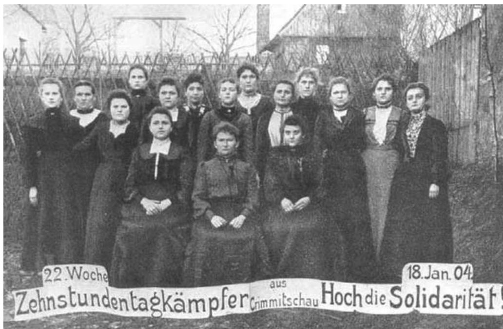
Figure 1.1 Photograph of a group of women campaigners for the ten-hour day in Crimmitschau, Saxony, taken on the final day of the twenty-two-week textile workers’ strike of August 1903 to January 1904.