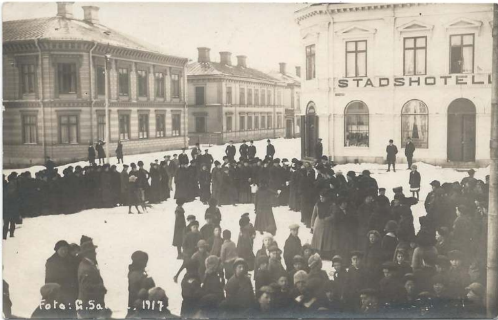
Figure 2.4 The women's hunger protest in Söderhamn, Sweden, on 11 April 1917.

daughters and sons at home on the grounds that there was 'nothing to put in the children's lunch boxes'. 113 The School Board attended a gathering in the public meeting house in the presence of 600 (unnamed) women and three (named) men, where it agreed to the women's demands to change the length of the school day to allow the women to feed the children what little they could before they left home and after they returned. The protocol clearly states that the School Board's agreement to the demands 'was greeted with cheers from the women' in attendance. 114 This example was soon followed by other local communities, and the new school day was soon introduced across the entire region by the regional School Board. Thus the women were actually in charge of events and pushed through proactive social change in Söderhamn for a few weeks during April and May of 1917. 115