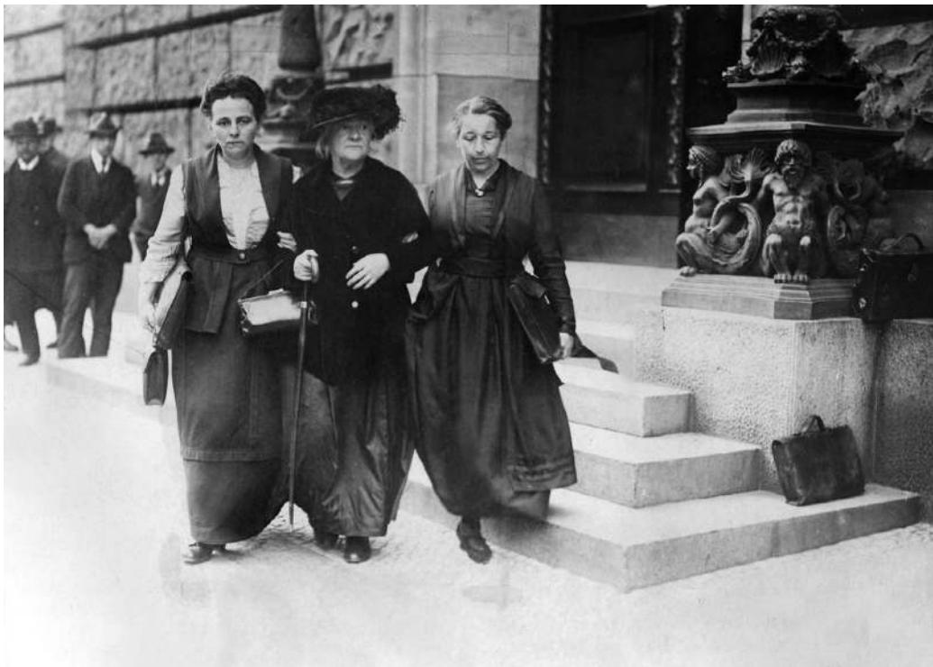
Figure 4.4 Clara Zetkin (1857–1933) with Lore Agnes (1876–1953) (left) and Mathilde Wurm (1874–1935) (right).

In Austria, the exhibition ' Sie meinen es politisch ' 100 Jahre Frauenwahlrecht in Österreich' (They Mean it Politically: 100 Years of Women's Votes in Austria) and accompanying book also stressed the agency of women, feminists and socialists alike, in achieving suffrage and included the women revolutionaries within the tradition of women's political activism. 115 It is notable that these exhibitions were curated in consultation with feminist scholars, including Kerstin Wolff (Archive of the German Women's Movement, Germany) in Frankfurt, and a team of leading labour and suffrage historians including Gabriella Hauch and Birgitta Bader-Zaar in Vienna.