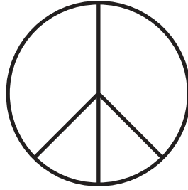
Figure 4. CND symbol