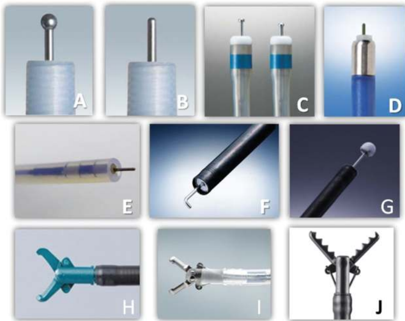
Figure 1. Devices used for colonic endoscopic submucosal dissection: A: Flush Knife (Fujifilm Medical, Tokyo, Japan); B: Flush Knife Ball Tip (Fujifilm Medical, Tokyo, Japan); C: DualKnife (Olympus Medical Systems Co., Tokyo, Japan); D: B-Knife (Zeon Medical, Tokyo, Japan); E: Splash needle (Pentax Co., Tokyo, Japan); F: Hook Knife (Olympus Medical Systems Co., Tokyo, Japan); G: IT Knife 2 (Olympus Medical Systems Co., Tokyo, Japan); H: Clutch Cutter (Fujifilm, Tokyo, Japan); I: SB knife Jr (Sumitomo Bakelite); J: Hemostat-Y forceps (PENTAX Medical, Germany).

ESD is technically dependent method and various devices have been introduced. Most of them have been developed in Japan [1, 4–21] ( Figure 1 ). The devices can be divided in two more general categories: needle-knife type and grasping type.