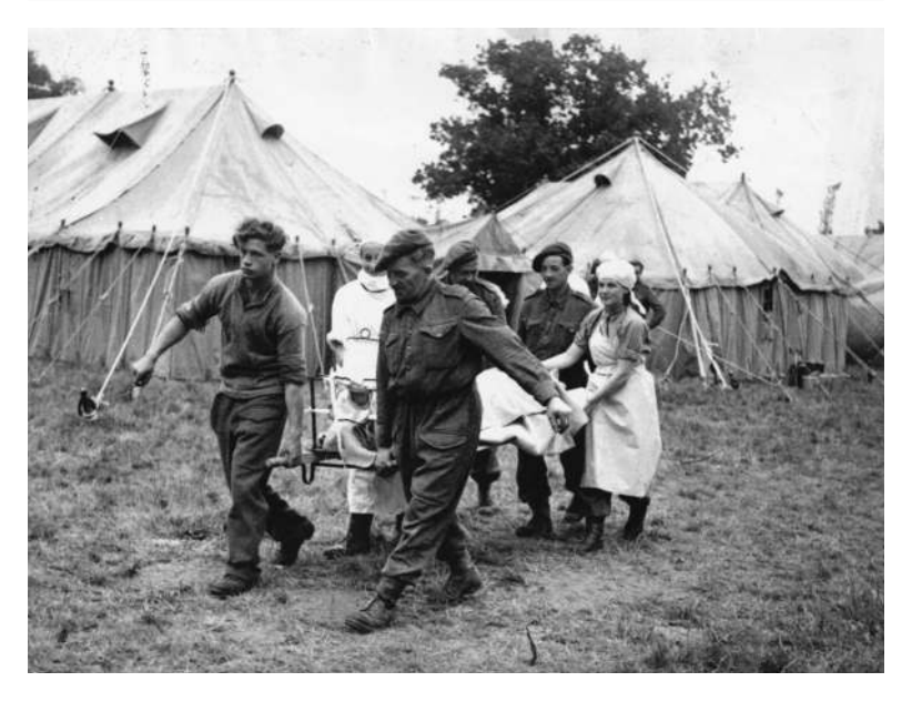
8 Italy. Sisters and RAMC orderlies carrying out a patient. This image reveals the collegiality between different members of the medical team. Such relationships were essential for successful patient care in active service conditions.

(the instrument used for taking blood pressures) and the monitoring of intravenous infusions in the inter-war period – doctors were pleased to hand over this now mundane work.<sup>26</sup> However, on active service overseas nurses were required not only to take over technologies from their medical colleagues<sup>27</sup> but also to develop skills with new technologies alongside doctors, thus shifting the balance from learning 'from' the medical profession to learning 'with' medical colleagues.