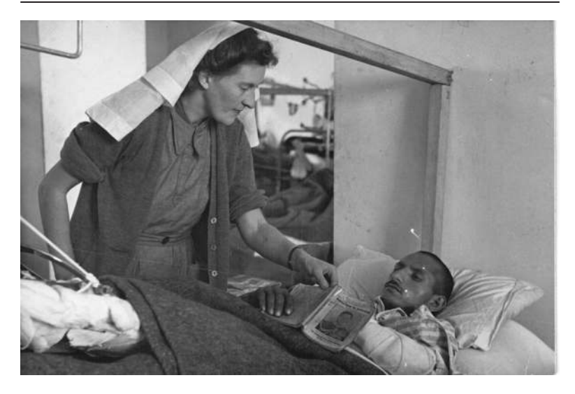
6 An older nurse during a quiet moment with a patient.

wrote of the helplessness of their combatant patients and that they are just 'boys', the reader is drawn both to the youth of the soldier, their need for a mother figure and the potential of impropriety that the proximity of young men to young single women raises. In using themselves as part of the recovery process, the complexity of the position of female nurses in war zones was intensified.