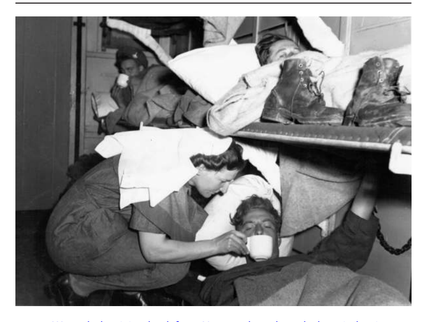
3 Wounded arriving back from Normandy on board a hospital train, 7 June 1944. Providing adequate nutrition for patients on moving hospital trains was not an easy task.

jugs, one was blue and one was white, and we used to make squash drink (limeade) – in one and keep that for the really ill boys that needed the vitamin C.^{98}