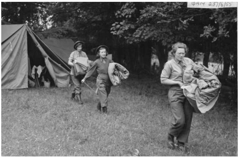
Normandy, 1944. Preparing the beds ... When nurses were posted into war zones, like their male soldier colleagues, they needed to prepare themselves for the possibility of shelling.