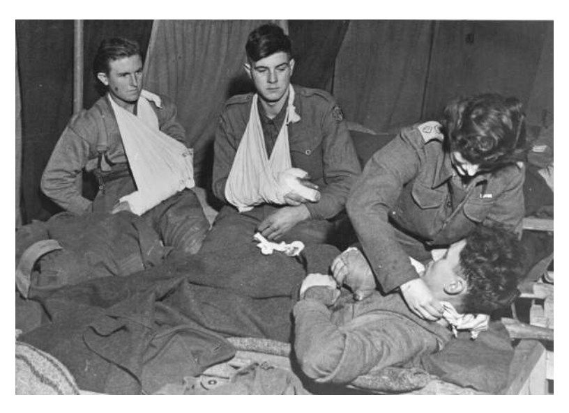
7 Field Hospital, Italy. A nurse demonstrates her clinical nursing skills. Note the compassion with which they were performed and the avid interest of the watching soldiers.

you couldn't imagine us saying we wouldn't go'. 47 In the absence of sufficient medical officers, nurses were needed to give blood transfusions, remove shrapnel from wounds and perform minor surgery. 48 Sister Elsie Driver was with a contingent of nurses posted from North Africa to Italy following the Salerno landings in September 1943. She and her colleagues expressed indignation when they were initially prevented from going ashore because the officers were unhappy about women entering a war zone.<sup>49</sup> According to Jean Bowden, the matron spoke for all of them when she maintained that 'we all feel that it would be wasteful to have brought us this far and not use us'. The next morning they landed on Italian soil and within one hour were setting up a hospital in a ruined school building and admitting convoys of men: 'The men on stretchers, desperately wounded though they were, heaved themselves up on an elbow to see the truth of the shout that went up: "Women! English sisters - here already".'50 In such cases the benefit to the sick and injured troops of British nursing sisters simply being there seemed to be greater than any treatment